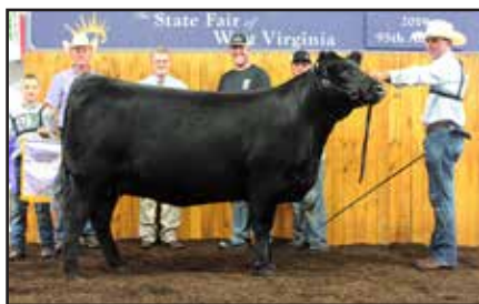
Reserve grand champion female Conley Miss Lucy 7011