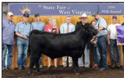
Grand champion bull Whitstone Calypso 9006