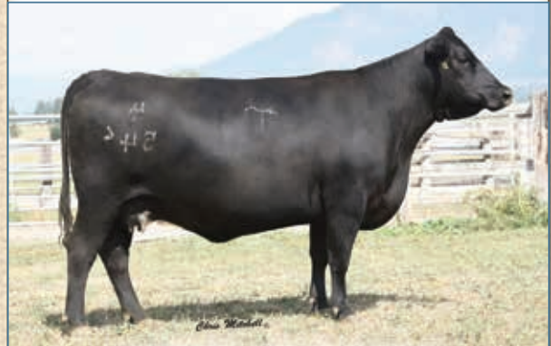
Thomas Lucy 4546 17985932

Sire: EXAR 263C • Dam's Sire: Mytty In Focus CED +8; BW +.9; WW +56; YW +99; Milk +34; MRB +1.01; RE -.04 $M +64 ; $W +71 ; $F +61; $G +59; $B +120; $C +220 Due 2/2/2020 to Thomas Xpansion 5810.