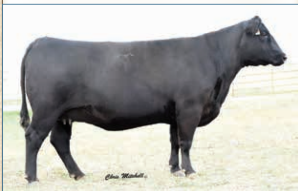
Thomas Blackbird 5118 18164252

Sire: Connealy Black Granite • Dam's Sire: Connealy Impression CED +3; BW +3.8; WW +68; YW +104; Milk +22; MRB +.31; RE +.63 $M +57; $W +67; $F +91; $G +39; $B +130; $C +226 Due 2/1/2020 to Thomas Absolution 6568.