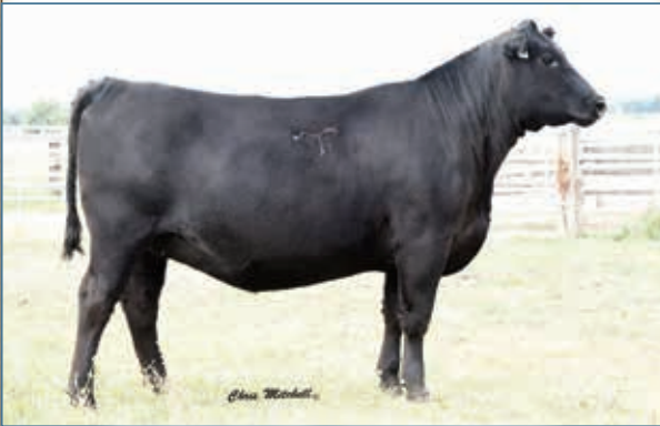
Thomas Patricia 8100 19160438

Sire: A&B Spottite 3065 • Dam's Sire: GAR Sunrise CED +8; BW +1.0; WW +66; YW +121; Milk +27; MRB +.98; RE +.31 $M +27 ; $W +66 ; $F +87; $G +67; $B +154; $C +227 Due 2/16/2020 to Leachman Foundation G081D.