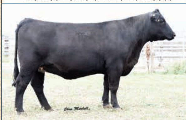
Thomas Patricia 7940 19128805

Sire: Plattemere Weigh Up K360 • Dam's Sire: PA Power Tool 9108 CED +6; BW +3.0; WW +75; YW +128; Milk +30; MRB +.75; RE +.64 $M +56; $W +70; $F +109; $G +61; $B +170; $C +277 Due 1/24/2020 to Thomas Absolution 6568.