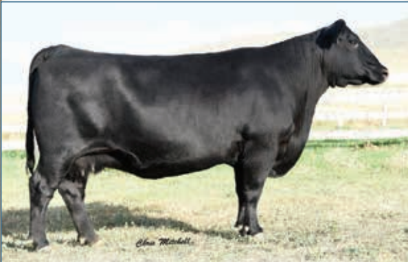
Thomas Ester 4764 18040305

Sire: AAR Ten X 7008 SA • Dam's Sire: SAV Net Worth 4200 CED +14; BW -1.1; WW +55; YW +96; Milk +20; MRB +.72; RE +.47 $M +55 ; $W +59 ; $F +83; $G +51; $B +133; $C +228 Due 2/2/2020 to Thomas Navigator 5771.