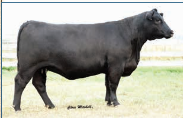
Thomas Primrose 7912 19123384

Sire: Thomas Big River 4081 • Dam's Sire: Werner War Party 2417 CED +1; BW +3.6; WW +75; YW +136; Milk +32; MRB +.33; RE +.87 $M +57; $W +72; $F +125; $G +43; $B +169; $C +276 Due 1/24/2020 to Thomas Absolution 6568.