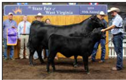
Grand champion cow-calf Buchanan's Georgina R266