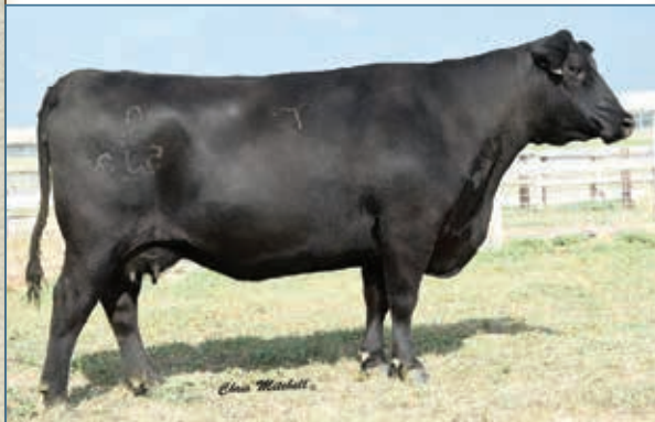
Thomas Elsa 0502 16698162

Sire: Thomas Grade Up 6849 • Dam's Sire: GAR US Premium Beef CED +5; BW +1.6; WW +46; YW +88; Milk +26; MRB +1.16; RE +.66 $M +31 ; $W +42 ; $F +93; $G +79; $B +172; $C +254 Sells open. Has a 8/19/19 bull calf at side by Thomas Big Data 7435. Elsa 0502 is the dam of Thomas Xpansion 5810.