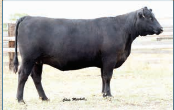
Thomas Swan 8129 19160347

Sire: EF Commando 1366 • Dam's Sire: Sitz Upward 307R CED +2; BW +3.5; WW +66; YW +115; Milk +35; MRB +.98; RE +.54 $M +70 ; $W +71 ; $F +71; $G +67; $B +138; $C +249 Due 1/24/2020 to Thomas Absolution 6568.