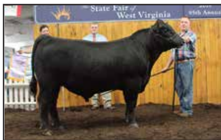
Reserve grand champion bull Circle R/BigRun Independence