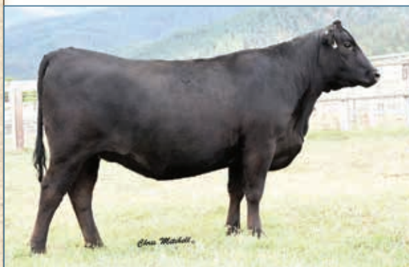
Thomas Miss Jet 7894 19128943

Sire: A&B Spotlite 3065 • Dam's Sire: GAR Predestined CED +7; BW +1.4; WW +64; YW +109; Milk +20; MRB +1.04; RE +.12 $M +41; $W +61; $F +48; $G +66; $B +115; $C +190 Due 3/18/2020 to SydGen Enhance.