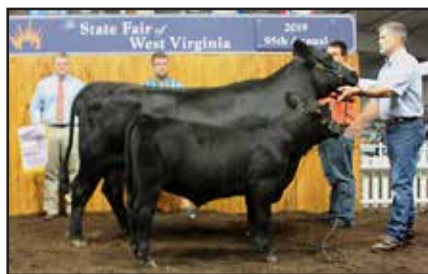
Grand champion cow-calf Whitestone Erica Z269