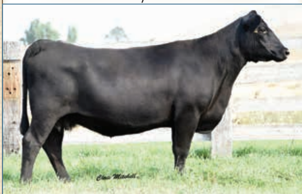
Thomas Lucy 5229 18164266

Sire: Connealy Black Granite • Dam's Sire: SS Objective T510 0T26 CED +13; BW +.4; WW +52; YW +93; Milk +34; MRB +.69; RE +.74 $M +73; $W +72; $F +81; $G +57; $B +138; $C +252 Due 2/2/2020 to Poss Maverick.