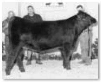
► Reserve late junior champion heifer, WCC Lady L449 , by Fort Angus Farm, Knightstown, Ind., and Wilson Cattle Co., Cloverdale, Ind. She's a March 2001 daughter of Twin Valley Precision E161.