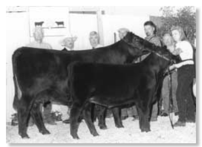
► Supreme champion, grand champion cow with natural calf and reserve champion udder, Champion Hill Phyllis 1868, by Fairlane Farm, Louisville, Ohio. She's a Jan. 2000 daughter of Famous 7001. Her calf is a March 2002 daughter of PVF New Horizon 001.