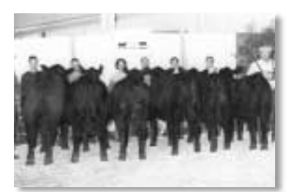
► Champion Hill, Bidwell, Ohio, exhibited the winning entry for breeder's best six head. Champion Hill also won the McCorkle Challenge Trophy for best bull and female owned or co-owned by an exhibitor.