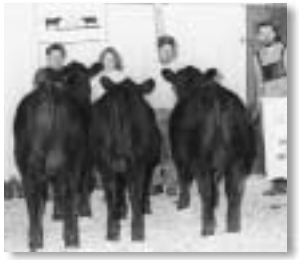
► First-place calf get-of-sire, progeny of Twin Valley Precision E161 , by Wilson Cattle Co., Cloverdale, Ind.