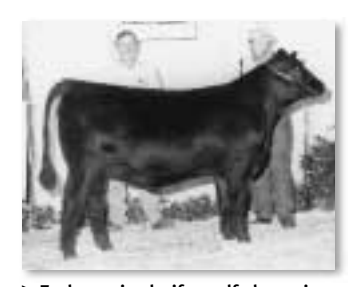
► Early senior heifer calf champion, Champion Hill Blossom 2632, by Champion Hill, Bidwell, Ohio, and Dobson Pulpwood Farm, Campti, La. She's a Sept. 2001 daughter of SAV Limited Edition 9283.