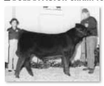
► Junior bull calf champion, WCC ZAF Hoosier Heartland, by Wilson Cattle Co., Cloverdale, Ind. He's a Jan. 2002 son of Twin Valley Precision E161.