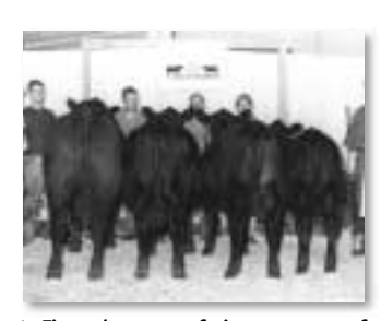
► First-place get-of-sire, progeny of Leachman Saugahatchee 3000C , by Champion Hill, Bidwell, Ohio.