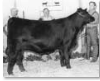
► Senior champion female, Champion Hill Lady 2185, by Champion Hill, Bidwell, Ohio, and Fox Cross Farm, Alderson, W.Va. She's a Sept. 2000 daughter of Leachman Saugahatchee 3000C.