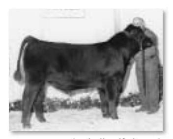
► Reserve senior bull calf champion, WCC Precisely L554 , by Wilson Cattle Co., Cloverdale, Ind. He's a Nov. 2001 son of Twin Valley Precision E161.