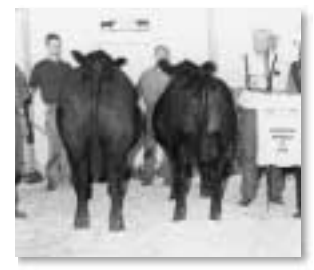
► First-place produce-of-dam, progeny of LLA Georgina 419 , by Champion Hill, Bidwell, Ohio.