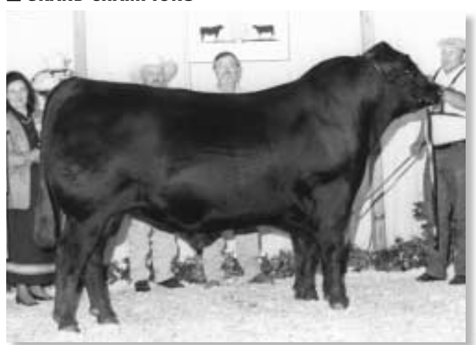
► Grand and senior champion bull, Champion Hill Hatchee 1973, by Champion Hill, Bidwell, Ohio, and Dobson Pulpwood Farm, Campti, La. He's a March 2000 son of Leachman Saugahatchee 3000C.