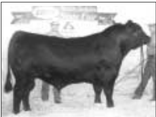
► Grand champion bull, Roth 216 LTD 9002 , by Roth Angus, Freeman; and Moffitt Angus Farms, Colfax, Iowa. He's a Jan. 1999 son of SVF GDAR 216 LTD.