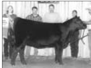
► Grand champion female, KWCC Isabell 0119 , by Kisse & Wallace Cattle Co., Mount Vernon, Mo. She's a Sept. 2000 daughter of GDAR SVF Traveler 234D.