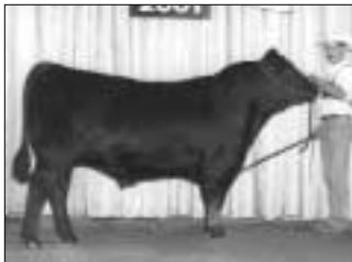
► Reserve grand champion bull, KWCC 71 Traveler 0006 , by Kisse & Wallace Cattle Co., Mount Vernon, Mo. He's a Jan. 2000 son of GDAR SVF Traveler 71.