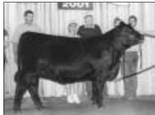
► Reserve grand champion female, HF Forever Lady 0006 , by Herbster Angus Farms, Falls City, Neb. She's a Jan. 2000 daughter of GDAR SVF Russ 184B.