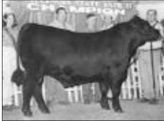
► Grand champion bull, Maple Lane Energizer 996 , by Maple Lane Angus, Lagrange, Ind.; Brecher Angus, Groveland; and Weaver Angus Farm, Peoria. He's a Nov. 1999 son of N-Bar Emulation EXT.