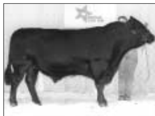
► Grand champion bull, HSAF Traveler 8180-504C , by Sana Associates, Chinook. He's a Nov. 1999 son of Sitz Traveler 8180.