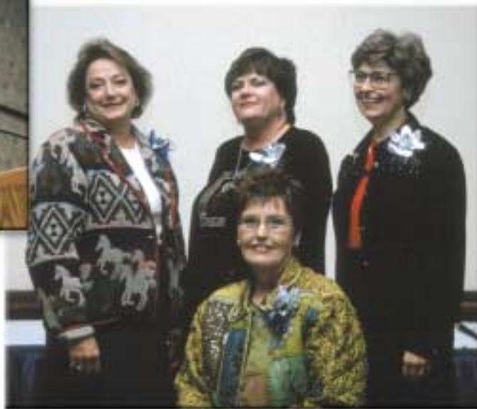
► Above: In addition to its traditional schedule of NAILE activities, the American Angus Auxiliary will kick off its 50th-anniversary celebration.