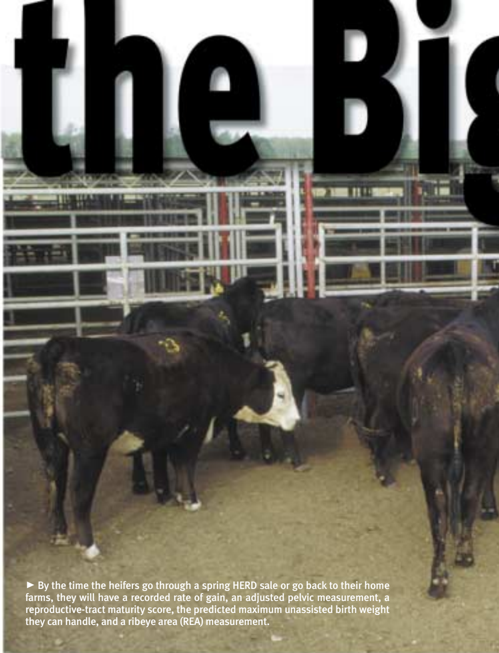
► By the time the heifers go through a spring HERD sale or go back to their home farms, they will have a recorded rate of gain, an adjusted pelvic measurement, a reproductive-tract maturity score, the predicted maximum unassisted birth weight they can handle, and a ribeye area (REA) measurement.

Heifers are put on a high-roughage growing ration of free-choice Bermuda grass or fescue