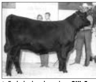
► Early junior champion, OHL Foxy Barbara 017-1 , by Fox Cross Farm, Alderson, W.Va. She's a Jan. 2000 daughter of Woodhill Supreme.