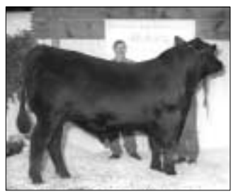
▶ Junior champion, Champion Hill Hatchee 1973, by Champion Hill, Bidwell, Ohio; and Dobson Pulpwood Farm, Campti, La. He's a March 2000 son of Leachman Saugahatchee 3000C.