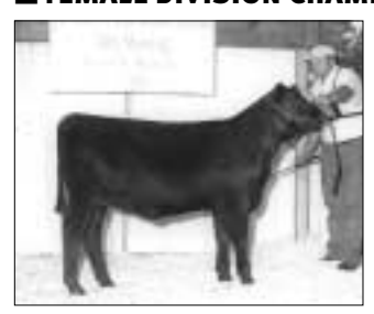
▶ Junior calf champion, Champion Hill Georgina 2335 , by Champion Hill, Bidwell, Ohio. She's a Jan. 2001 daughter of Leachman Saugahatchee 3000C.