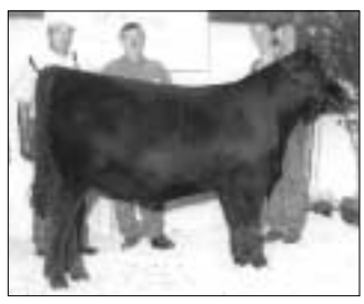
► Reserve early senior calf champion, Champion Hill Lady 2182 , by Champion Hill, Bidwell, Ohio; and Kahn Cattle Co. LLC, White, Ga. She's a Sept. 2000 daughter of Leachman Saugahatchee 3000C.