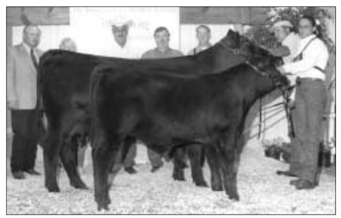
► Reserve grand champion cow with natural calf, Champion Hill Shadoe 1422 , by Champion Hill, Bidwell, Ohio; and Dobson Pulpwood Farm, Campti, La. She's a Jan. 1999 daughter of Leachman Saugahatchee 3000C. Her calf is a Jan. 2001 son of Generation Band 505.