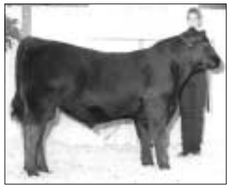
► Reserve senior calf champion, Dalton's Jones Rito 0252 616 , by S&C Farms, Sharpsburg, Ky. He's a Sept. 2000 son of Rito 616 of 4B20 6807.