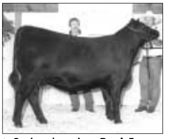
► Senior champion, Boyd Forever Lady 9145 , by Boyd Beef Cattle, Mays Lick, Ky.; and Hancock Angus Cattle, Crossville, Tenn. She's a Nov. 1999 daughter of Leachman Prompter.