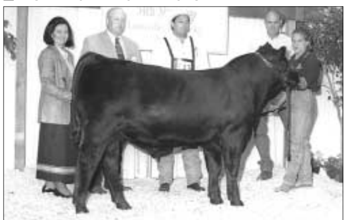
▶ Reserve grand and senior calf champion bull, EXAR Improvement 0913 , by Express Angus Ranches, Shawnee, Okla. He's a Nov. 2000 son of Northern Improvement 4480 GF.