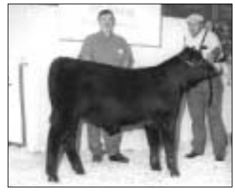
▶ Junior calf champion, Champion Hill Band Wagon , by Champion Hill, Bidwell, Ohio; and Dobson Pulpwood Farm, Campti, La. He's a Jan. 2001 son of Generation Band 505.