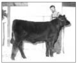
► Reserve junior calf champion, WCC Blackcap L340, by Wilson Cattle Co., Cloverdale, Ind. She's a Jan. 2001 daughter of G13 Fortune 425 8068.