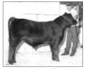
► Reserve junior calf champion, WCC Design L314 , by Wilson Cattle Co., Cloverdale, Ind. He's a Jan. 2001 son of B/R New Design 323.