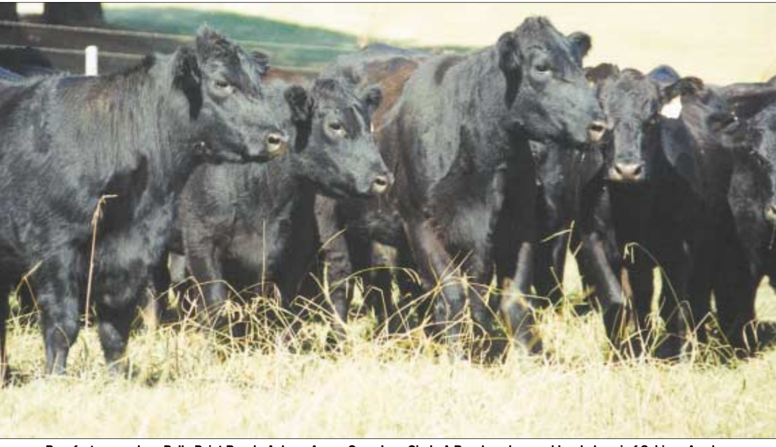
Benefactors, such as Belle Point Ranch, Ankony Angus Corp. Inc., Circle A Ranch and several local alumni of Subiaco Academy, have donated registered animals, labor or materials to the new seedstock venture.

The abbot also recognizes the community's commitment and is thankful for it.