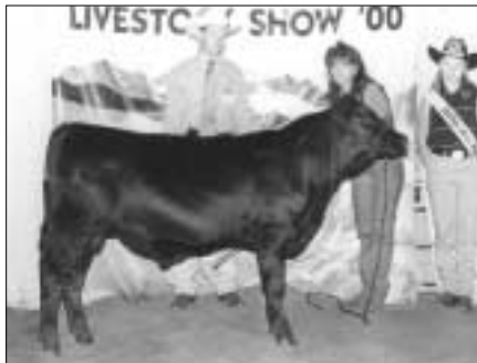
Reserve grand champion bull, TJ Black Jack W625 , by TJ Cattle Co., Columbus. He's a Feb. 2000 son of OGL Battle Cry 427 128.