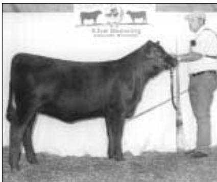
Late senior heifer calf champion Champion Hill Georgina 1799