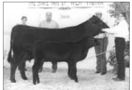
Reserve grand champion cow-calf pair, Champion Hill Georgina 1019 , by Champion Hill, Bidwell, Ohio, and Dynasty Farms, Gallipolis, Ohio. She's a Jan. 1998 daughter of Whitestone Widespread MB. Her calf is an April 2000 son of Champion Hill Brave.