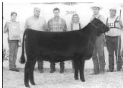
Reserve grand champion female, Champion Hill Peg 1763 , by Champion Hill, Bidwell, Ohio, and Fox Cross Farm, Lewisburg. She's a Sept. 1999 daughter of LF New Trend 4100.