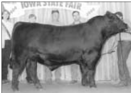
Reserve grand champion bull, Roth 216 LTD 9002 , by Roth Angus, Freeman, S.D., and Moffitt Angus Farms, Colfax. He's a Jan. 1999 son of SVF GDAR 216 LTD.