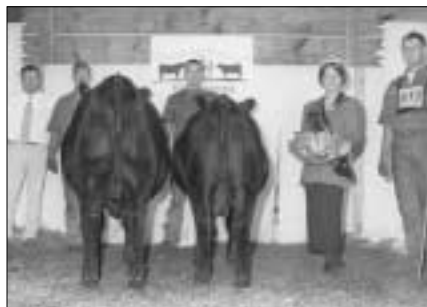
(l) First-place produce of dam Progeny of TC Peg 9100