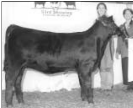
Junior heifer calf champion Gamble Dutchess Saugahatchee