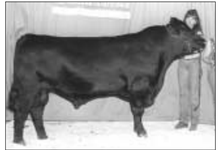
Grand champion bull, TJ Amigo V615 , by TJ Cattle Co., Columbus, and Suburban Home Farm, Spencer, Ind. He's a Feb. 1999 son of TC Stockman 365.