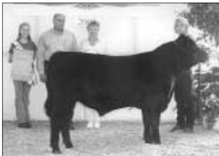
Grand champion bull, Sugar Loaf 5161 of 608 , by Sugar Loaf Farms, Staunton, Va. He's a Sept. 1999 son of TRA Forever And Ever 608.