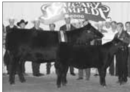
Duralta 14C Echo 32E Supreme champion female Stampede Supreme Beef Competition