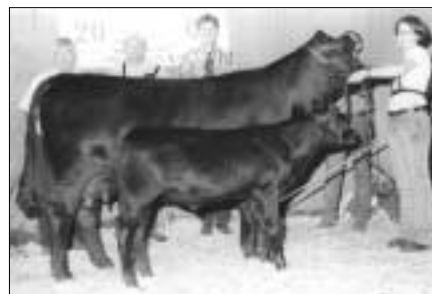
Grand champion cow-calf pair, Champion Hill Georgina 1019 , by Champion Hill, Bidwell, and Dynasty Farms, Gallipolis. She's a Jan. 1998 daughter of Whitestone Widespread MB. Her calf is an April 2000 son of Champion Hill Brave.