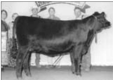
Grand champion female, JAC's Maggie 8325 , by JAC's Ranch, Bentonville, Ark. She's a Dec. 1998 daughter of Krugerrand Merger 34.