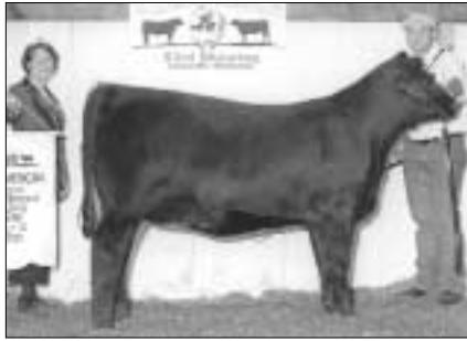
Reserve late intermediate champion female Champion Hill Heidi 1718