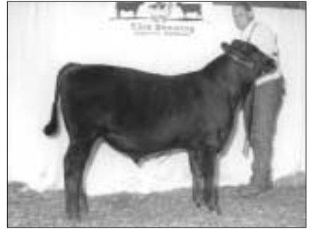
Reserve junior bull calf champion BK JW Shooter