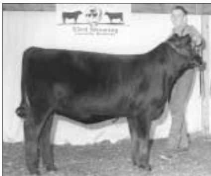
Reserve late senior heifer calf champion Davis Forever Lady 9391