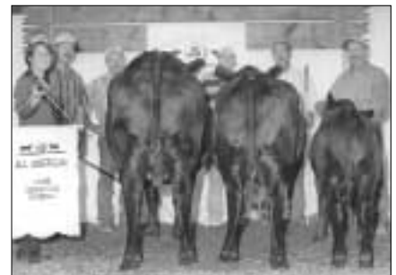
(r) First-place three-generation maternal Cedar Creek Farm, Donalds, S.C.