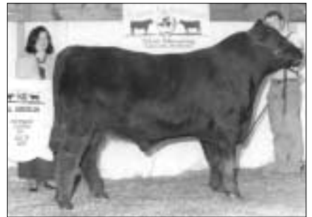
Intermediate champion bull APS Stock Traveler