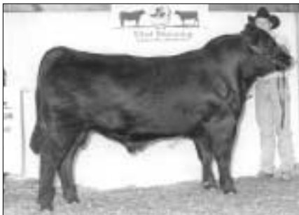
Reserve intermediate champion bull G13 Balance 9106