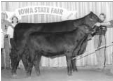
Grand champion cow-calf pair, SAF Forever Lady 5138 , by Herbster Angus Farms, Falls City, Neb. She's a Feb. 1995 daughter of SAF Fame. Her calf is a Feb. 2000 daughter of HF Stockman 710.