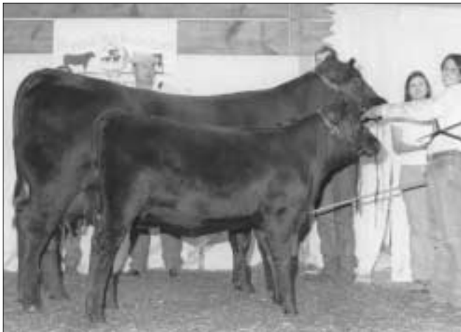
Supreme champion and grand champion cow with embryo calf Champion Hill Georgina 1019