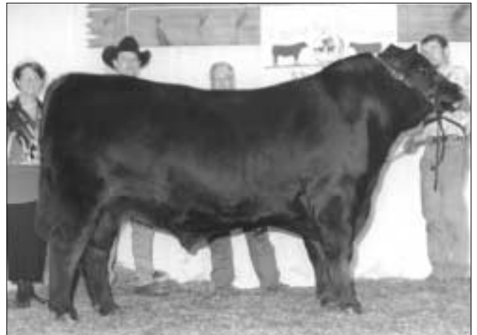
Grand and senior champion bull G13 Fortune 425C 8068