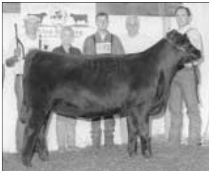
Reserve grand and early senior calf champion female Champion Hill Peg 1763