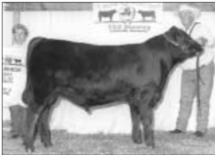
Senior bull calf champion WCC Coach 1768