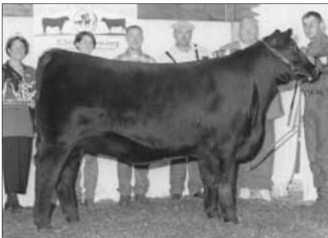
Grand and late junior champion female Champion Hill Peg 1580