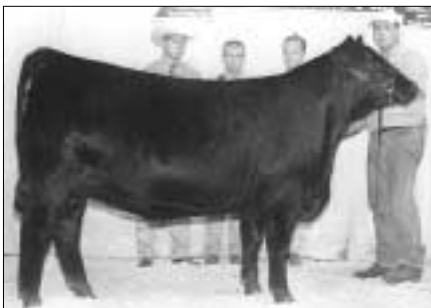
Reserve grand champion female, EGL Elluna 9357 , by Eagle Pass Ranch, Highmore. She's a Feb. 1999 daughter of TC Stockman 365.