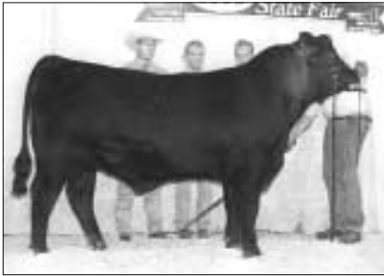
Grand champion bull, Roth 216 LTD 9002 , by Roth Angus, Freeman, and Moffitt Angus Farms, Colfax, Iowa. He's a Jan. 1999 son of SVF GDAR 216 LTD.