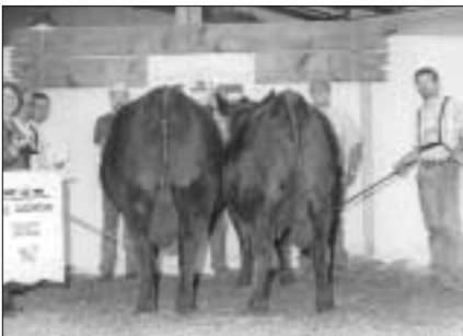
(l) McCorkle Challenge Trophy Wilson Cattle Co., Cloverdale, Ind.