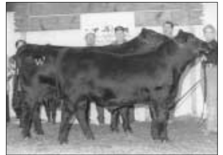
(r) Reserve grand champion cow with embryo calf Whitstone Rita H024 of 5H27