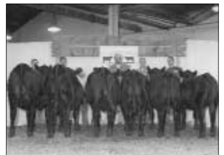
(r) Best six head Champion Hill, Bidwell, Ohio