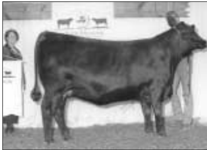
Senior champion female Womack's Queen Mother 1868