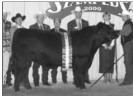
ACN DMM Dynasty 15J Supreme champion bull Stampede Supreme Beef Competition