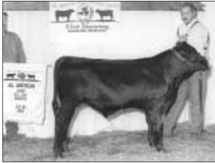
Junior bull calf champion Cedar Creek Traveler 2010