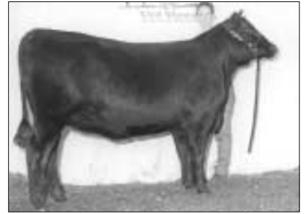
Early intermediate champion female Champion Hill Lady 1629