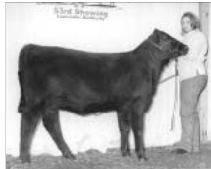
Reserve junior heifer calf champion Champion Hill Blackbird 1901