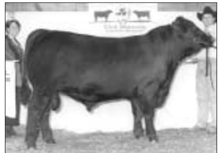
Reserve junior champion bull G13 Stockman 9122