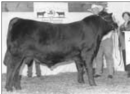
Junior champion bull WCC First Class 1627