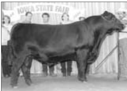
Grand champion bull, MCC Goldberg 873 , by Kisse and Wallace Cattle Co., Mount Vernon, Mo. He's a Sept. 1998 son of Sitz Traveler 043.