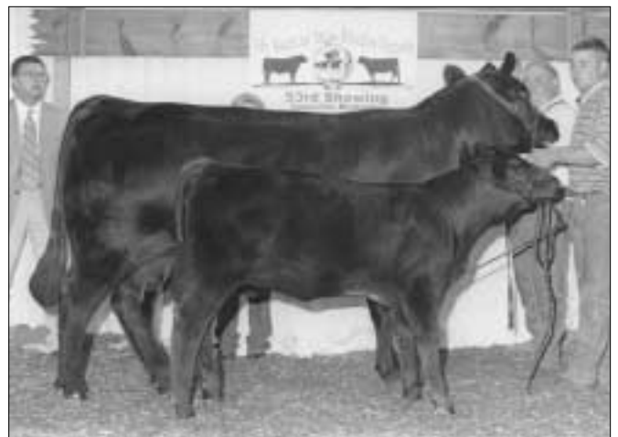
Grand champion cow with natural calf Twin Valley Blackcap 108