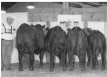
(l) First-place get-of-sire Progeny of Leachman Saugahatchee 3000C