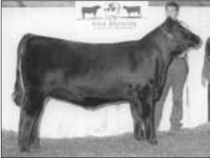
Reserve early intermediate champion female Bolsen's Golden Shedaisy