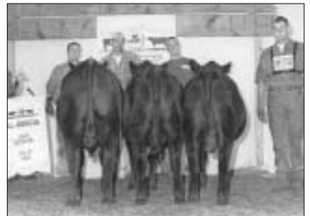
(r) First-place junior get-of-sire and calf get-of-sire Progeny of LF New Trend 4100