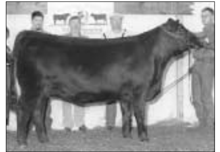
Reserve senior champion female Champion Hill Phyllis 1375