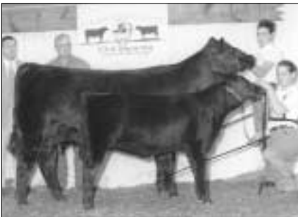
(l) Reserve grand champion cow with natural calf and grand champion udder Champion Hill Blackcap 1210