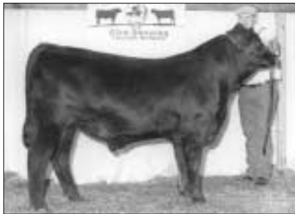
Reserve senior bull calf champion Champion Hill 4100 1757