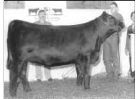
Early junior champion female Champion Hill Shadoe 1422