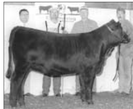
Reserve early senior heifer calf champion Champion Hill Peg 1747