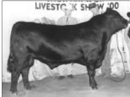
Grand champion bull, TJ Amigo V615 , by Suburban Home Farm, Spencer, Ind., and TJ Cattle Co., Columbus. He's a Feb. 1999 son of TC Stockman 365.