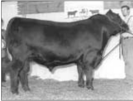
Reserve grand and reserve senior champion bull MT Valley Fullback 810