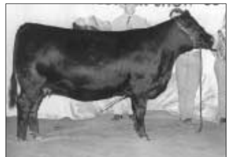
Reserve grand champion female, NA Miss Playmate 8167 , by Nissen Angus, Chinook, and Corey A Ranch, North Plains, Ore. She's a Sept. 1998 daughter of Leachman Checkmate.