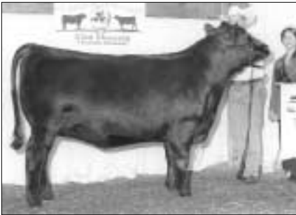
Reserve early junior champion female Sedgwick's Erica 9211