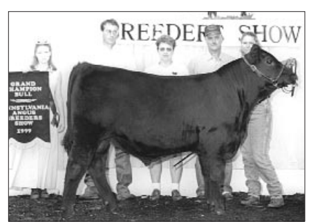
Grand champion bull, Weaverland Fullback 829 , by Weaverland Valley Farms, New Holland. He's an Oct. '98 son of Rito 9FB3 of 5H11 Fullback.