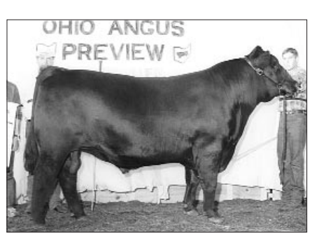
Reserve grand champion bull, Champion Hill Brave , by Champion Hill, Bidwell, and Dobson Pulpwood Farm, Campti, La. He's a May '97 son of Leachman Saugahatchee 3000C.