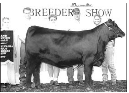
Grand champion female, Weaverland Edella McKala , by Weaverland Valley Farms, New Holland. She's an April '98 daughter of Rito 9FB3 of 5H11 Fullback.