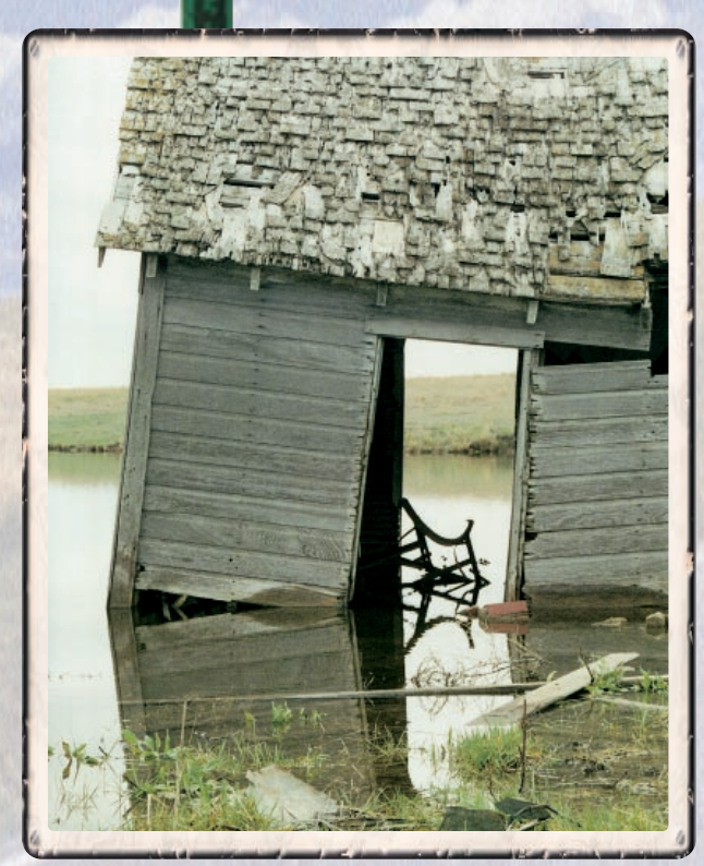
2nd — Reed Parker, Idalia, Colo.

Judges' comments: "The photographer has captured the boy's pensive emotion. Good true color contrast and interesting lines. Simplicity of the image keeps the eye focused on the central figures — the boy and the heifer."