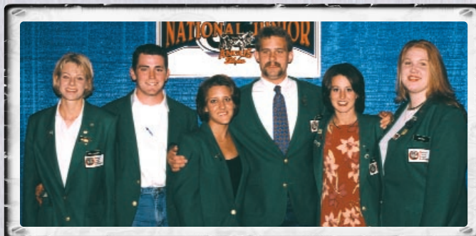
After months of hard work preparing for the National Junior Angus Show (NJAS), the retiring Board members share a few special moments following the awards ceremony.