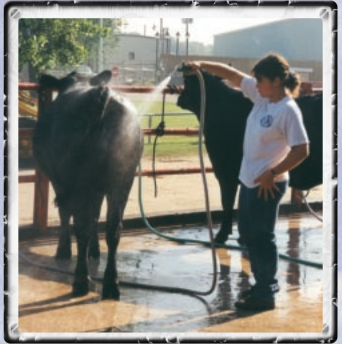
Wash racks provide relief as temperatures hover just below 100°F on the first day of the show.