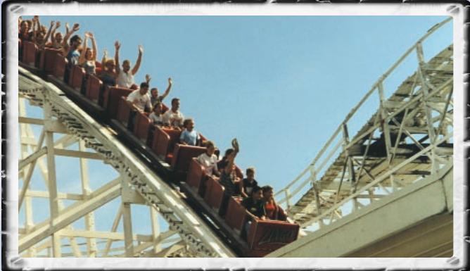
Juniors relax at Bell's Amusement Park after the show on Saturday.