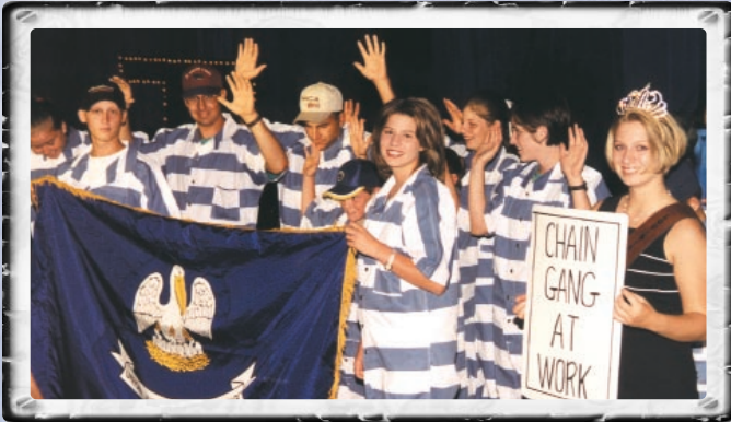
Chain gang members from Louisiana march through opening ceremonies.