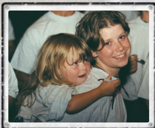
Wisconsin juniors await the parade of states.