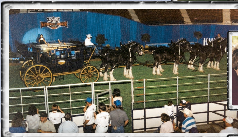
The opening ceremonies were an amazing sight.