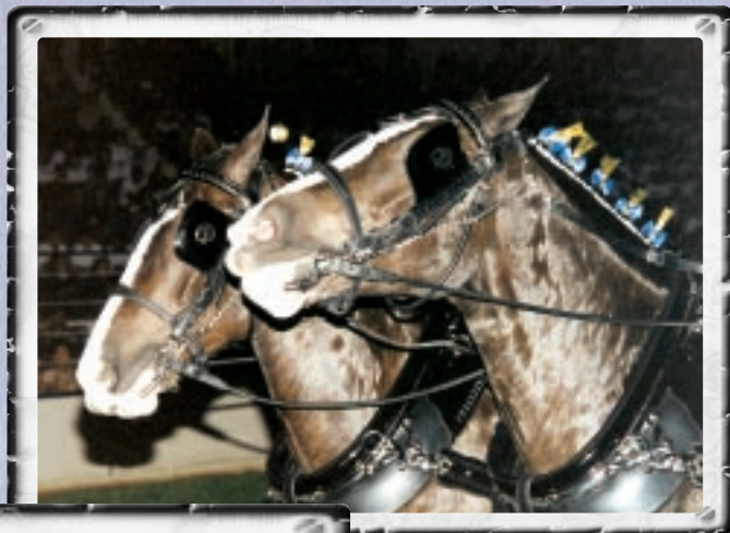
Express Ranches' six-horse hitch entertained juniors during opening ceremonies.