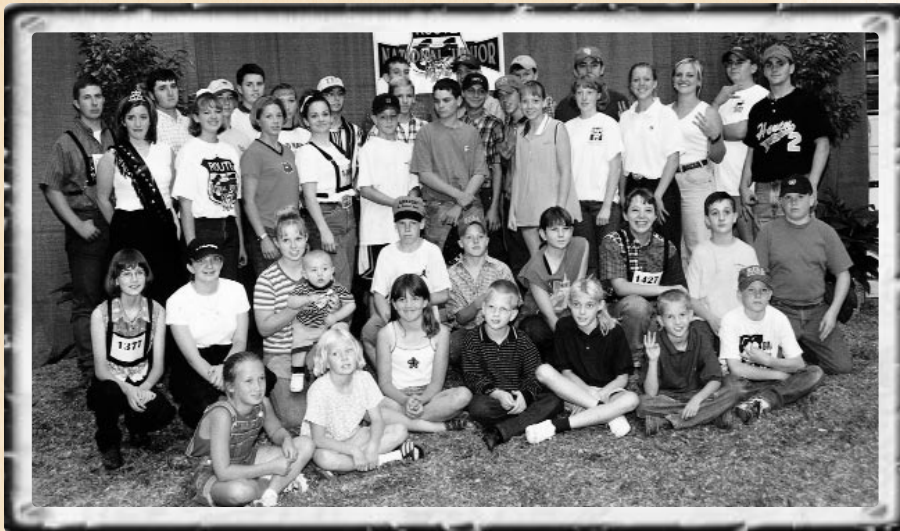
Members of the Kansas Angus Junior Association won the sweepstakes contest for the third year. This award is based on leadership and participation in educational activities and contests held throughout the week.