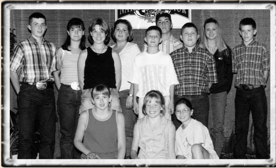
Top scrapbook — Michigan