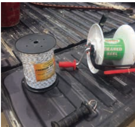
▶ Ian Gerrish recommends only one type of portable electric fencing — the braided polywire. The black economy gate handles pictured are what he has found works best for an end to a reel.