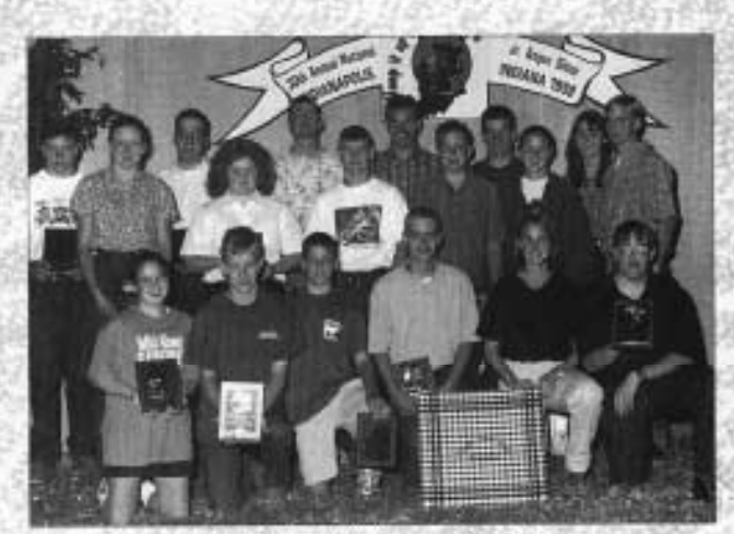
Best state herdsmanship — 16-35 head Georgia Junior Angus Association