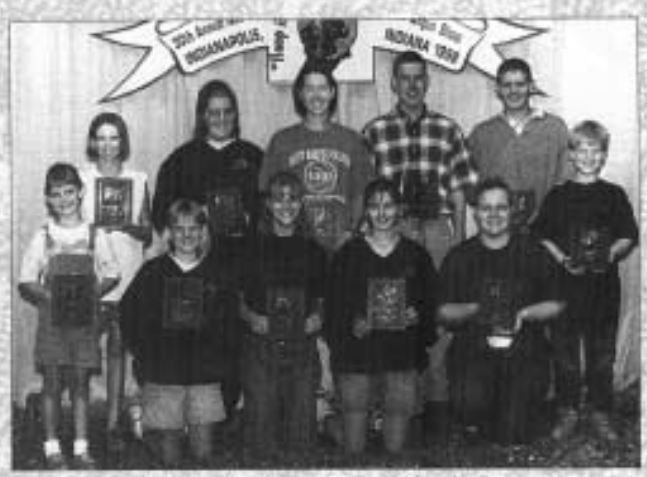
Best state herdsmanship — 15 head or less Minnesota Junior Angus Association