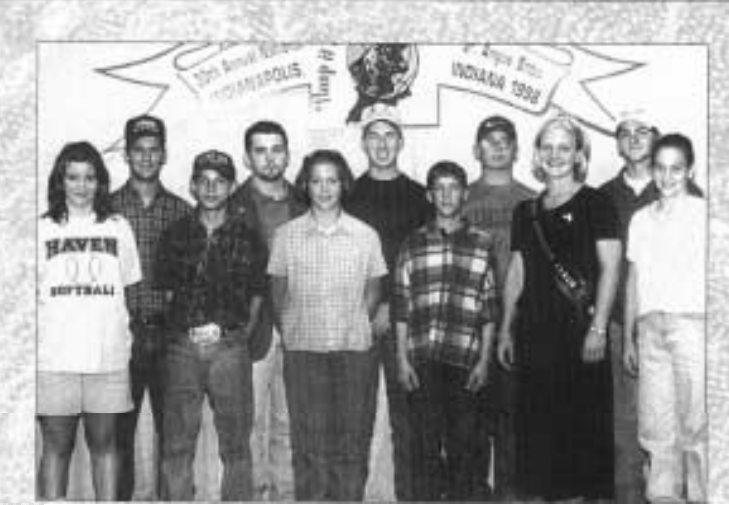
Members of the Kansas Junior Angus Association won the sweepstakes contest. This award is based on leadership, participation in educational activities and contests held throughout the week.