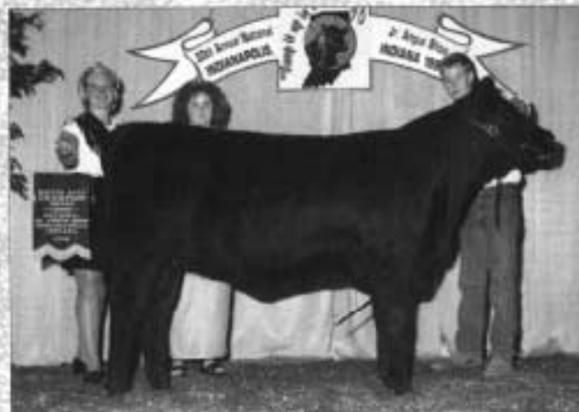
Call champion Ankony Princess 153P