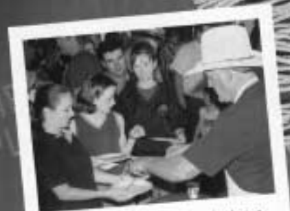
Servin' up that famous Texas barbecue.