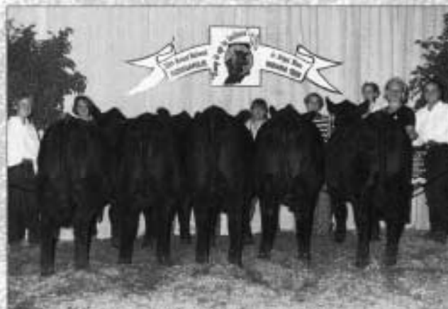
State group best five head Illinois Junior Angus Association