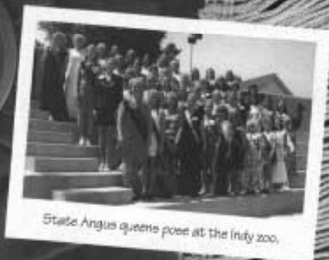
State Angus queens pose at the Indy zoo.