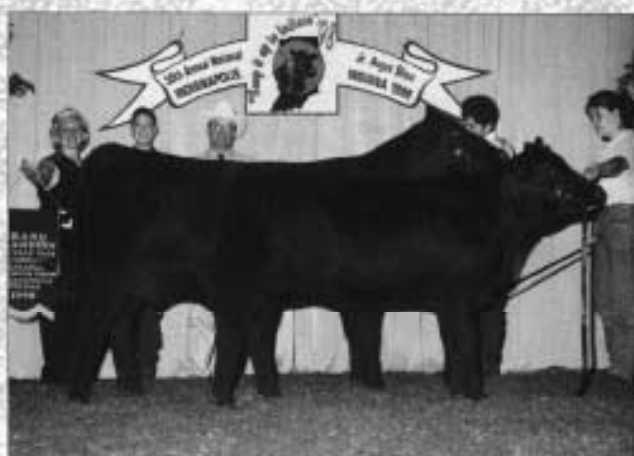
Grand champion Beck Pride 5196