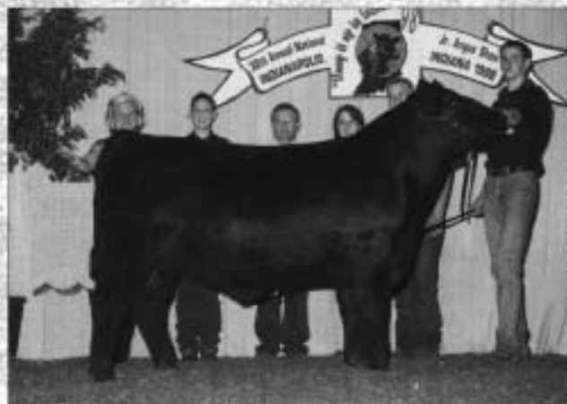
Reserve grand champion Dalton's High Expectation