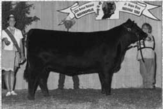
Reserve senior champion ZA Lady Tara 46