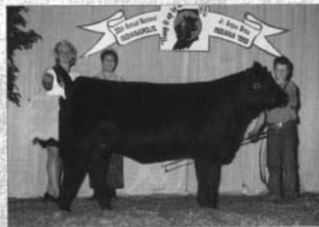
Reserve call champion WK Princess Pride 7903