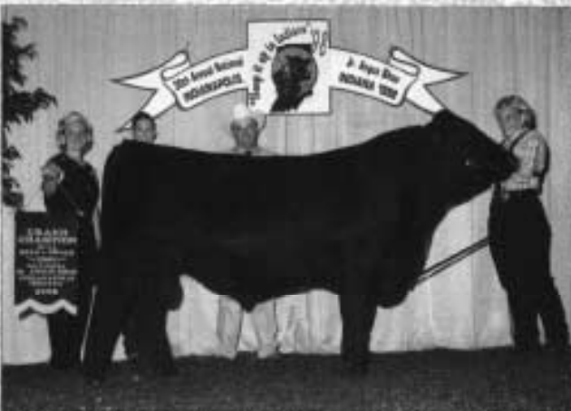
Grand and intermediate champion bred-and-owned bull A&B Yukon 7150