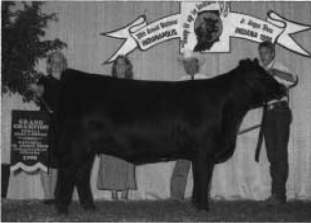
Grand and early junior champion bred-and-owned female Womack's Primrose Lucy 147