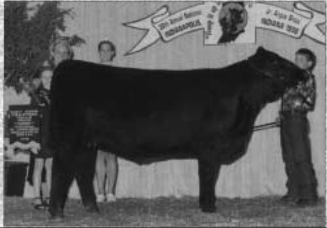
Early junior champion BC Blackbird Girl M 107