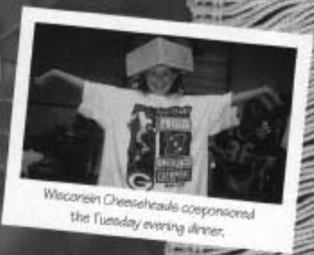
Wisconsin Cheeseheads cosponsored the Tuesday evening dinner.