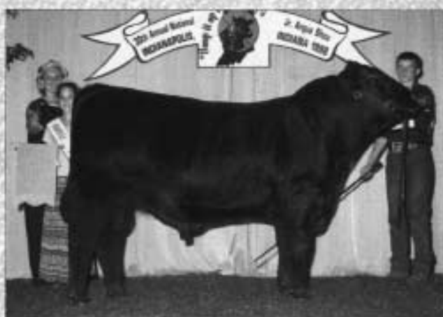
Reserve junior champion Schroeder's Millennium 57