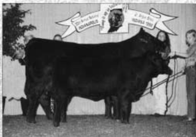
Reserve grand champion Womack's Miss Lucy 1285