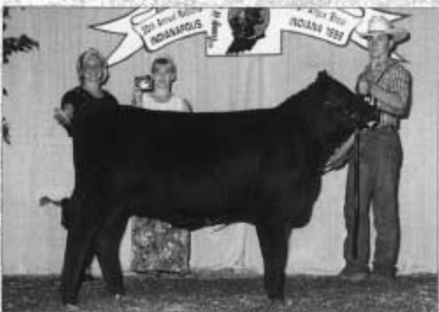
Reserve calf champion Sedgwick's Ann 7317