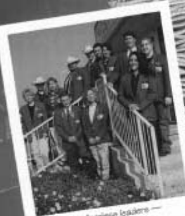
Your fearless leaders — the Green Jackets.