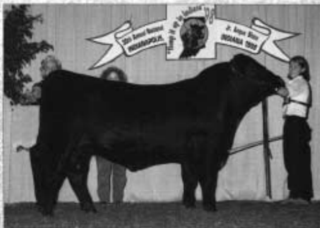
Reserve intermediate champion Car Don Eliminator B413