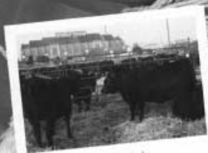
Tie-outs in Indy.