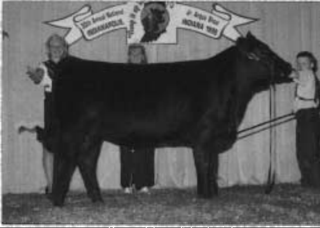
Reserve Intermediate champion WAR Blackbird Lady 7279