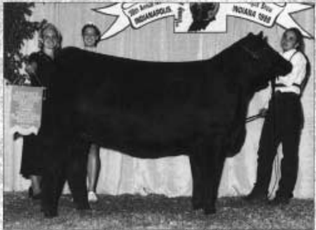
Reserve early junior champion BLR Lady Stacker 7057