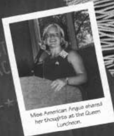
Miss American Angus shared her thoughts at the Queen Luncheon.