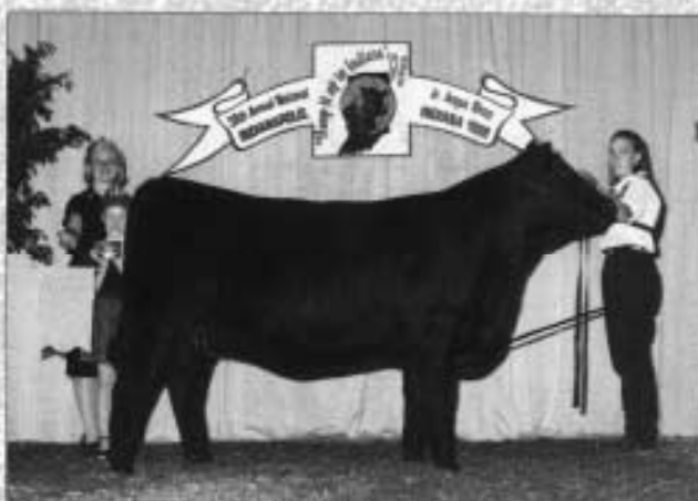
Reserve senior champion LAB Blackcap Elba 6121