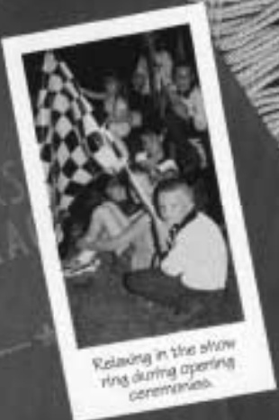
Relaxing in the show ring during opening ceremonies.