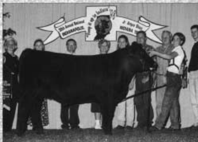
Grand champion SBA Cougar