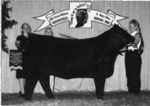
Late junior champion TCC Dalton's Gina 702