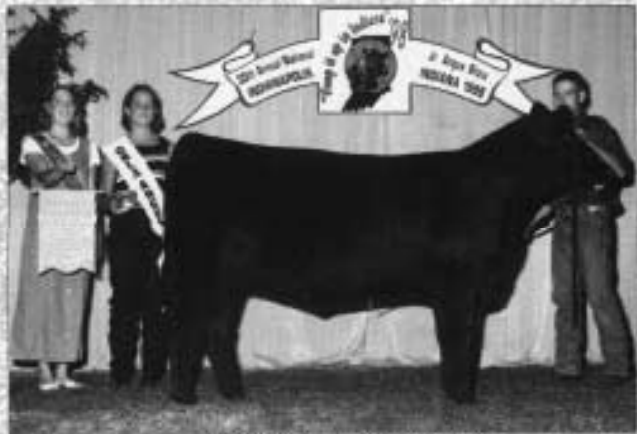
Reserve intermediate champion WA Miss Ultimatum 7057