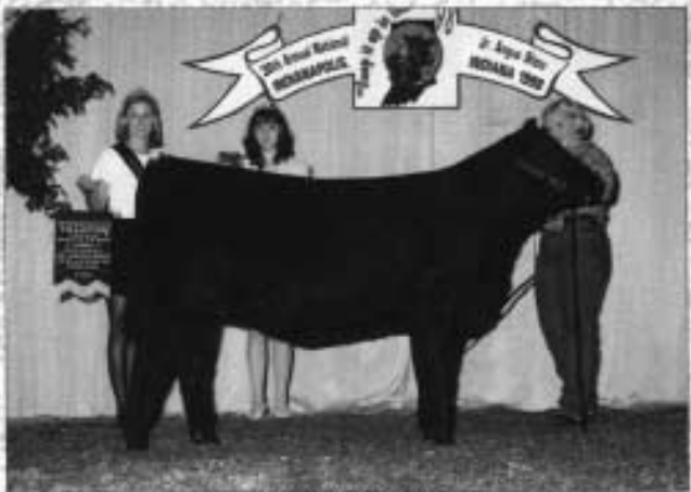
Intermediate champion A&B Blackbird 7176