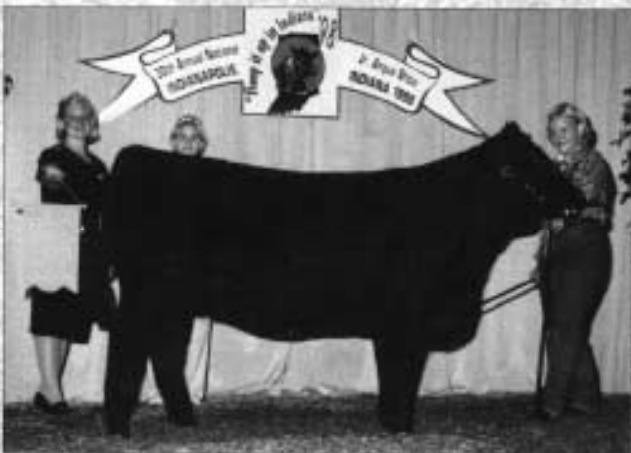
Reserve late junior champion A&R Queen 7221