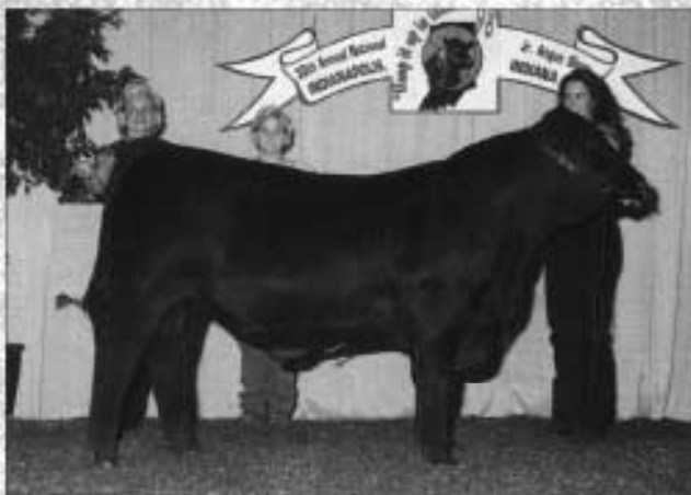
Reserve calf champion Gamble's TT Fullback