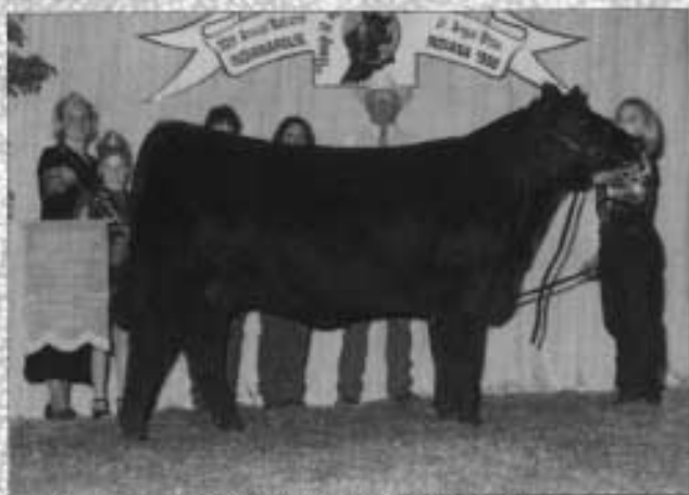
Reserve grand and senior champion Davis Peggy Sue 6303