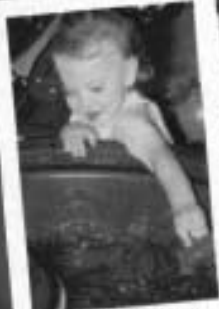
Playing in water during the carnival.