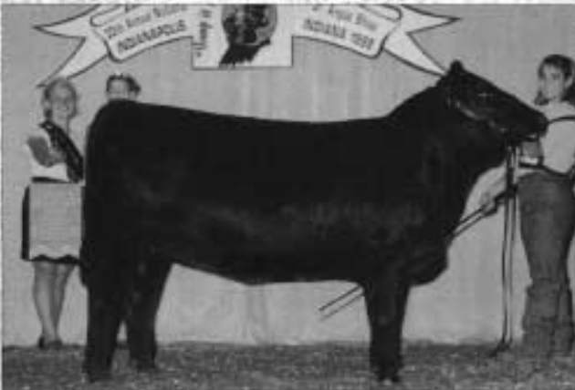
Reserve late junior champion Maplecrest Anastasia