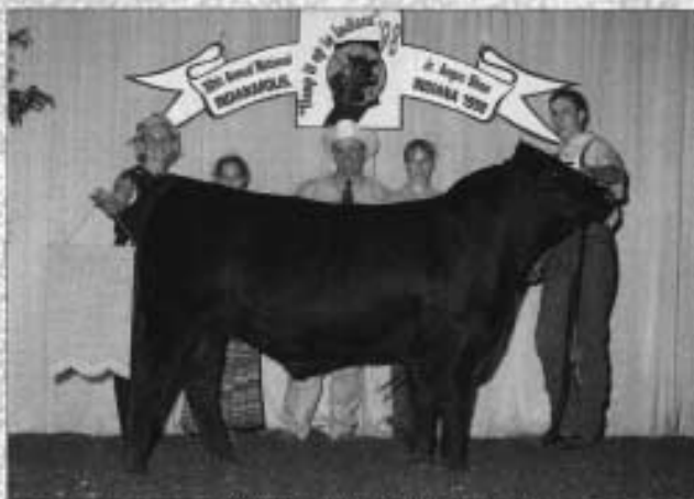
Reserve grand and calf champion BC Johnny Walker Black Label