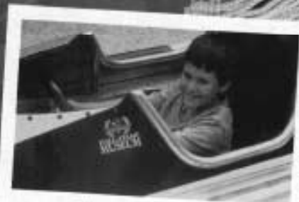
The next Inly 500 winner!