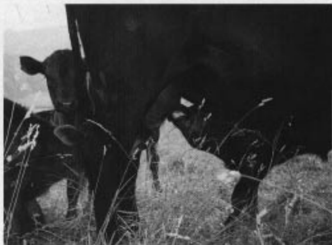
3rd — Kevin Clay Corbin, Eggon, W.Va.

Judges comments: "The quietness of the reclining animal is emphasized by side lighting and definition between foreground, middle and background. Black & white use of texture is strong with subtle greys."