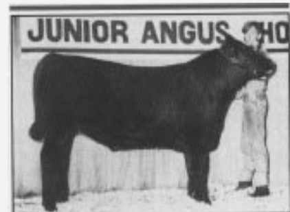
Reserve champion steer Fervale Hogan