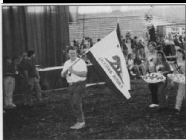
The California juniors display their state's character and colors during opening ceremonies.