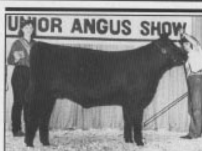
Owned reserve heifer calf champion FFF Diablo McFly