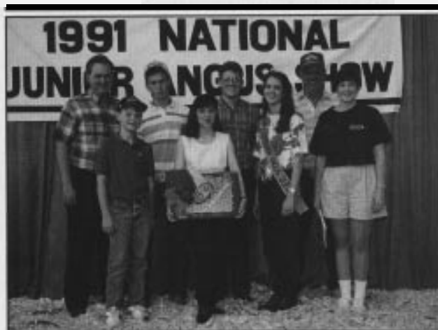
A Mardi Gras theme helped the Louisiana juniors top the scrapbook competition.