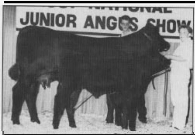
Grand champion cow-calf pair DA Fair Lea 4293 and her April bull calf