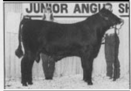
Reserve bred-and-owned bull calf champion Prairie View Shogun