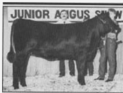
Late junior champion owned heifer WAR Sara 0209 7142