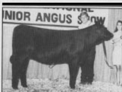
Owned heifer calf champion R&J Lassy 2050