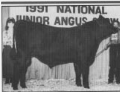
Intermediate champion bred-and-owned bull MS MacArnie