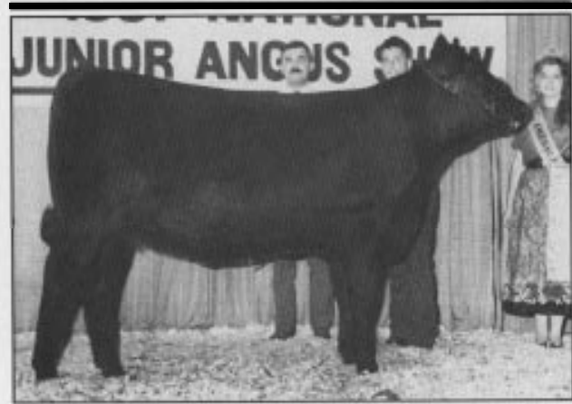
Grand champion owned heifer Nelson Elba Lassie 0357