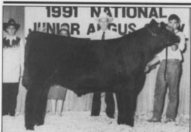
Grand champion steer WAR Power 0360