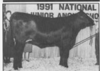
Reserve senior yearling champion bred-and-owned female KK Star