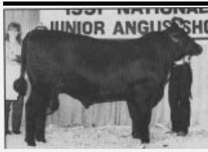
Reserve junior champion bred-and-owned bull S&R Innovator 0103