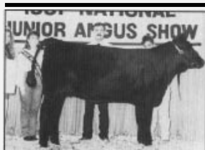
Reserve late junior champion owned heifer McIntosh Kazy M40