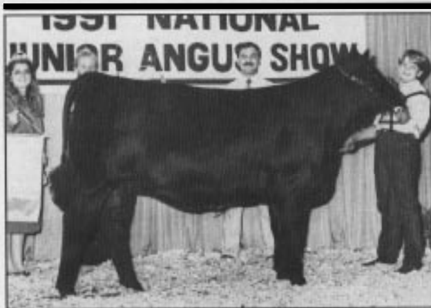
Grand champion bred-and-owned heifer Patton Beatrice Audrey 08