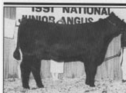
Reserve senior yearling champion owned heifer Mengs Lucy 107Y