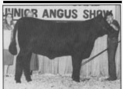
Reserve champion late junior bred-and-owned heifer CSC Elba 20