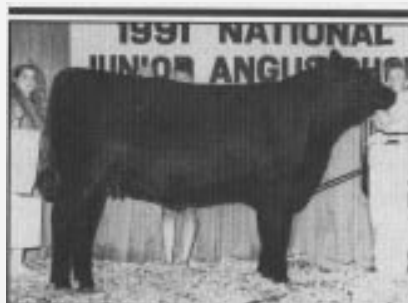
Senior yearling champion owned heifer DA Brittany 7693