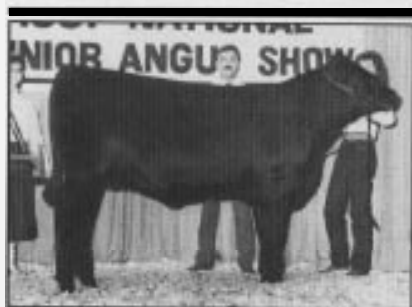
Reserve grand champion owned heifer SAV Mac Jestress 1761