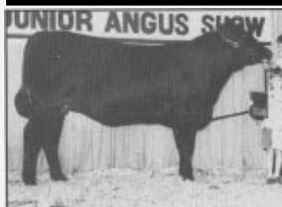
Senior yearling champion bred-and-owned female B&R MacKenzie Erick 8916