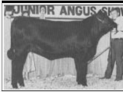
Reserve intermediate champion bred-and-owned heifer Davis Ella Dee 428