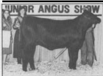
Bred-and-owned heifer calf champion SAF Portia