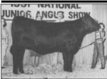
Reserve grand champion bred-and-owned heifer WAF Julia Belle 005