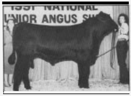
Reserve intermediate champion bred-and-owned bull CF Inferno