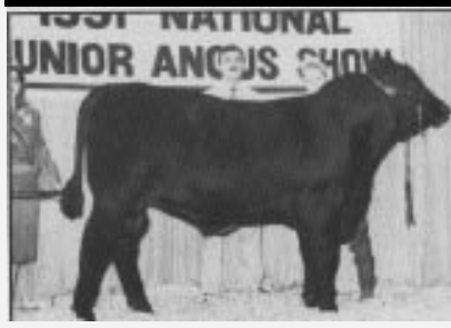
Reserve grand champion bred-and-owned bull Walls Prompter 034