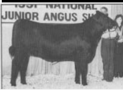
Reserve champion early junior bred-and-owned heifer Dameron Miss Eraline 022