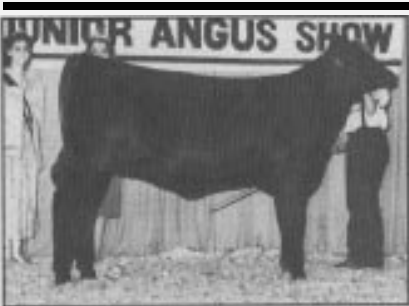
Intermediate champion bred-and-owned heifer CF Ashley