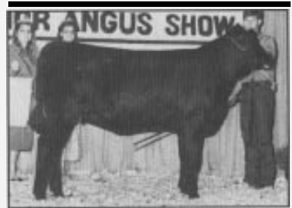
Reserve champion bred-and-owned heifer calf SAF Stormy G