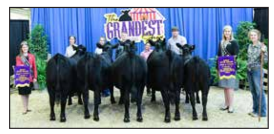
The Nebraska Junior Angus Association won bred-and-owned state group of five.