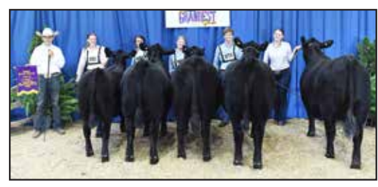
The Illinois Junior Angus Association won owned state group of five.