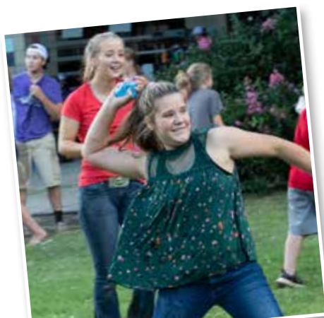
The second session's water-balloon fight began with just a few heavily tossed balloons.