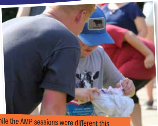
While the AMP sessions were different this year, older Angus members were still able to connect with and mentor younger juniors.