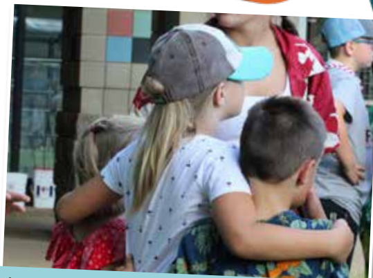
The calm before the storm — Angus juniors gathered close to listen to their NJAB members explain the second session's activities.