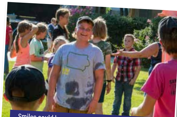
Smiles could be seen on NJAA members' faces during the entire session, even after the chaos of the water-balloon fight concluded.