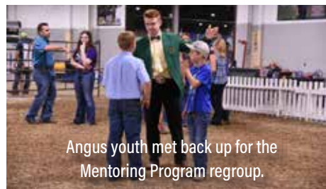
Angus youth met back up for the Mentoring Program regroup.