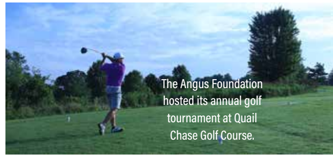
The Angus Foundation hosted its annual golf tournament at Quail Chase Golf Course.