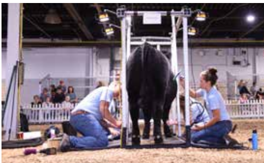
Top: Cooking skills, along with CAB and beef knowledge, were put to the test during the American Angus Auxiliary-Sponsored All-American CAB Cook-Off. Bottom: State teams participated in the fitting contest sponsored by Weaver Livestock.

Total donations during NJAS are estimated to be worth $1,000.