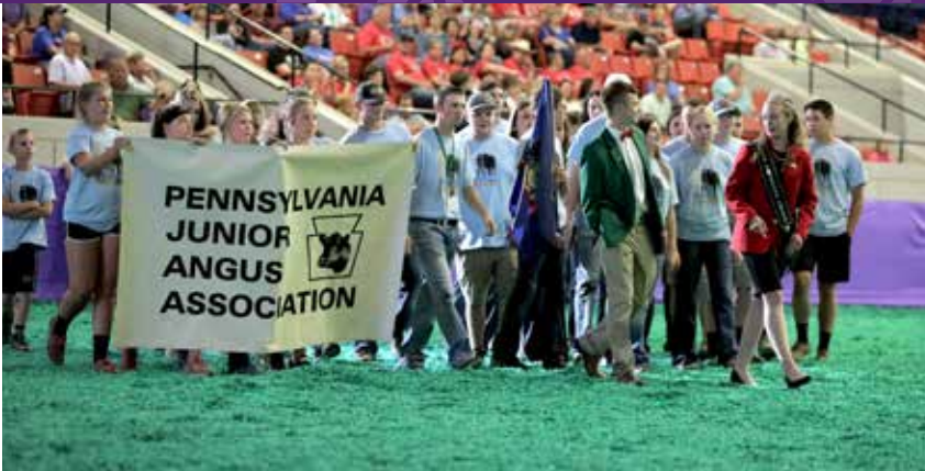
A group from the 2020 NJAS host state, Pennsylvania, made their way out to the green chips during Opening Ceremonies on Monday.