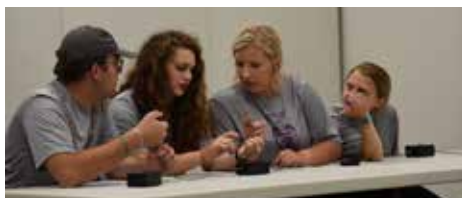
Juniors had to think quickly and answer questions correctly to move on in the quiz bowl finals.