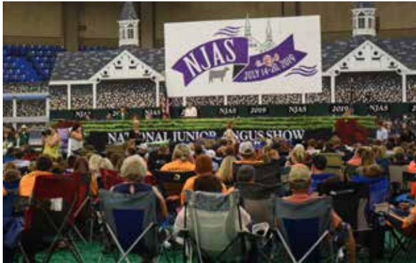
Top: Owned heifers took the ring Friday morning. Bottom: NJAA members filled the show ring floor for the awards night program.