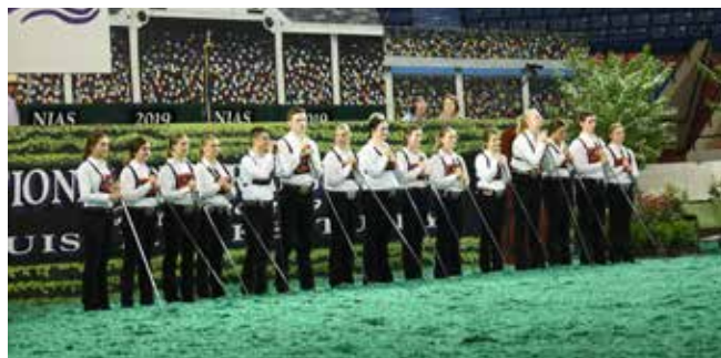
Top: Showmanship finals kicked off the last day of the NJAS.