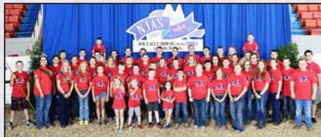
The Indiana Junior Angus Association won herdsmanship for 61 head or more.