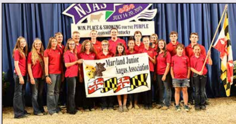
The Maryland Junior Angus Ass'n won first-place scrapbook. Not pictured are the Washington Jr. Angus Ass'n, second; Wisconsin Jr. Angus Ass'n, third; Kansas Jr. Angus Ass'n, fourth; and the Iowa Jr. Angus Ass'n, fifth.