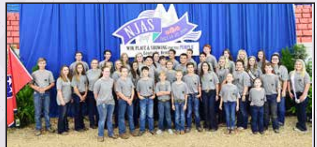
The Tennessee Junior Angus Association won herdsmanship for 46-60 head.