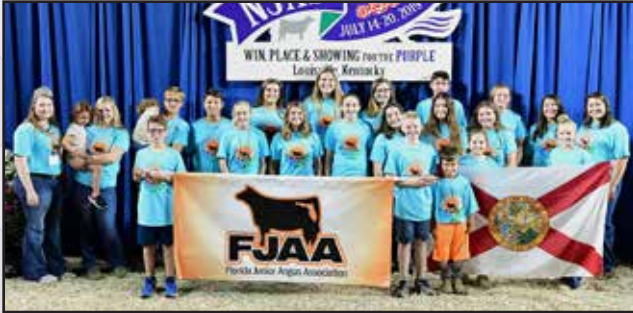
The Florida Junior Angus Association won sweepstakes for 29 head or less.