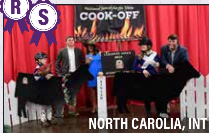
NORTH CAROLIA, INT