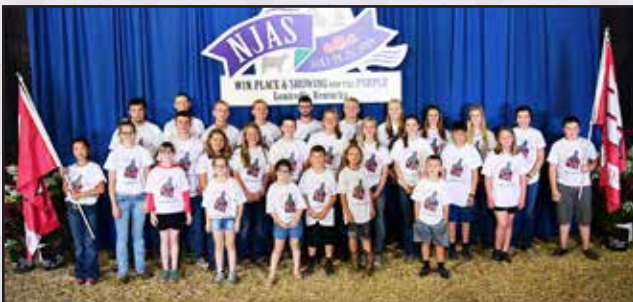
The Wisconsin Junior Angus Association won herdsmanship for 31-45 head.