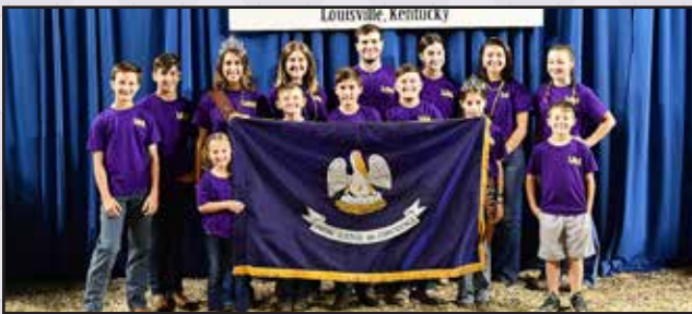
The Louisiana Junior Angus Association won herdsmanship for 15 head or less.