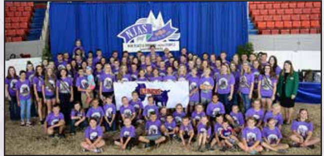
The Illinois Junior Angus Association won sweepstakes for 30 head or more.