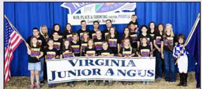
The Virginia Junior Angus Association won herdsmanship for 16-30 head.