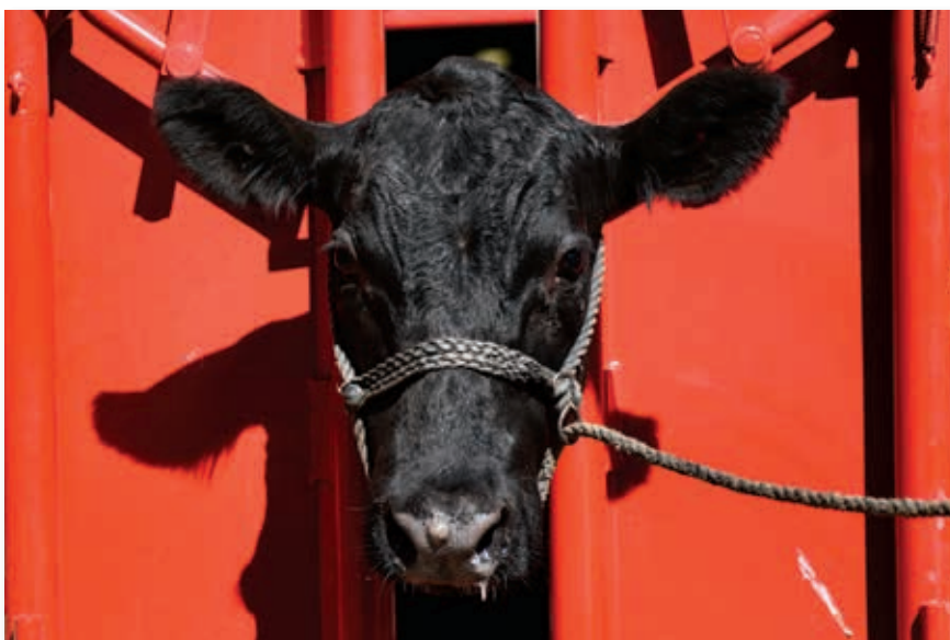
Bird's-eye view from the chute as this steer prepares to load into the trailer.