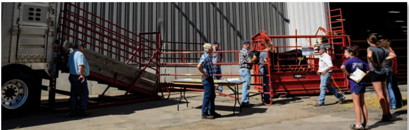
Steers are tagged and weighed in the chute before being loaded onto the trailer.

checked in, exhibited and placed. The carcass steer contest is unique to the NJAS due to the fact that exhibitors don't exactly "show" these steers; they send them off