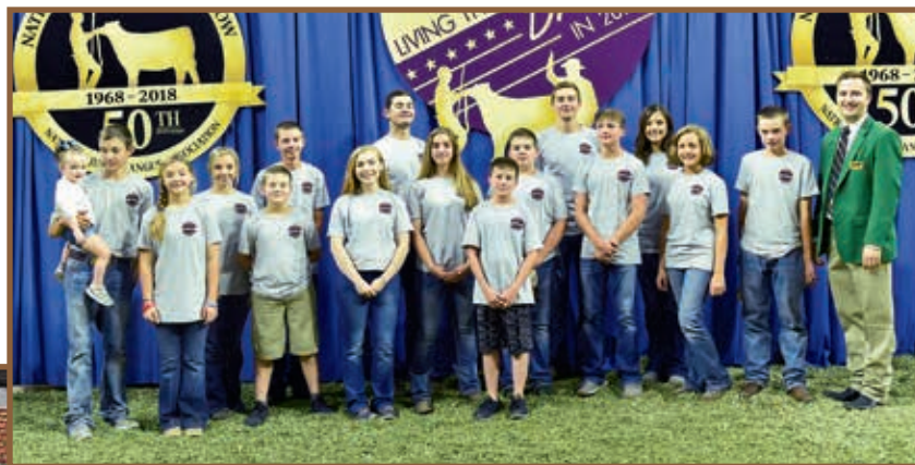
Right: The Arkansas Jr. Angus Ass'n won the sweepstakes award for states with 29 head or less.