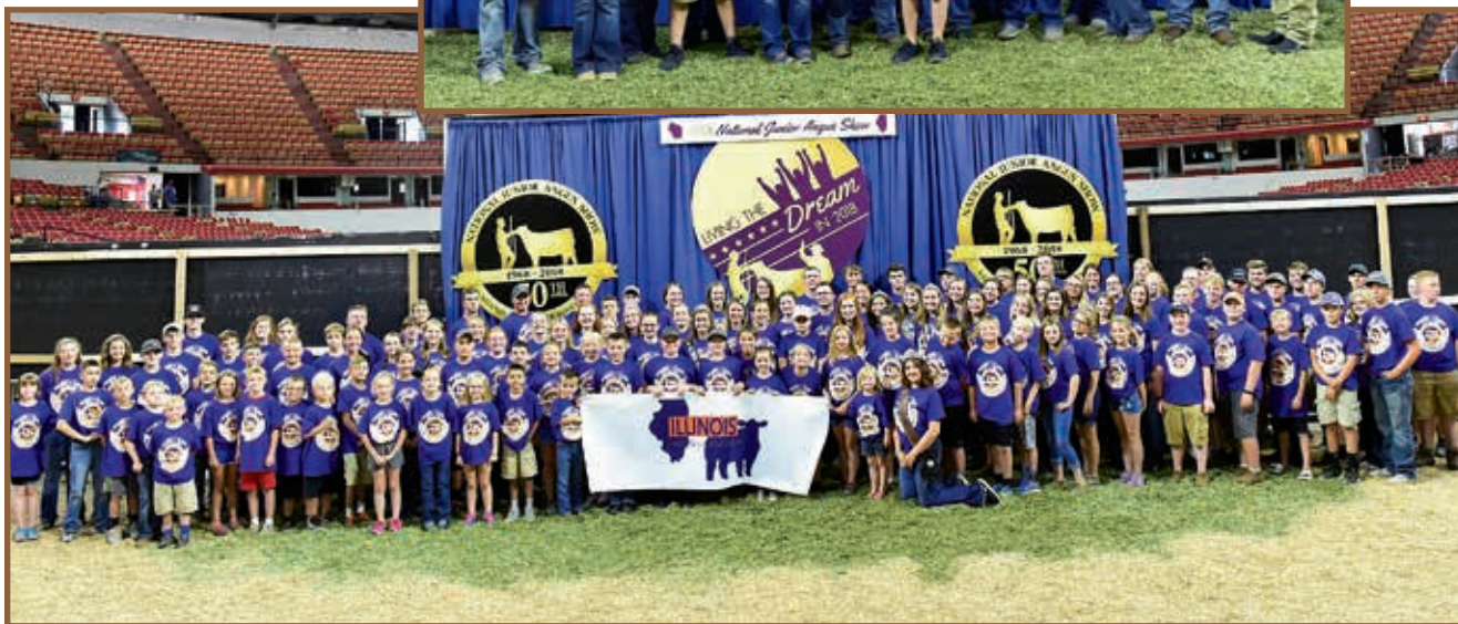
The Illinois Jr. Angus Ass'n won the sweepstakes award for states with 30 head or more.