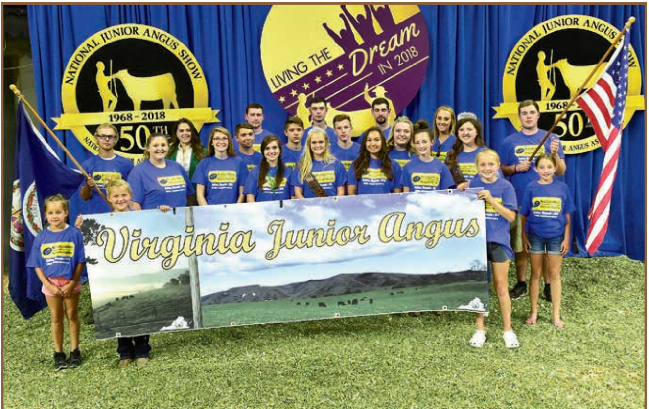
The Virginia Jr. Angus Ass'n won first-place scrapbook. Not pictured are the Maryland Jr. Angus Ass'n, second; Nebraska Jr. Angus Ass'n, third; Louisiana Jr. Angus Ass'n, fourth; and Kansas Jr. Angus Ass'n, fifth.