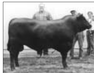
► Reserve grand champion bull, DA New Design 0102 , by Dels Acres, Oregon. He's a Feb. 2001 son of Bon-View New Design 878.