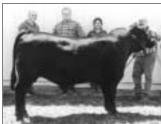
► Grand champion bull, Royal Dimension , by Royal Angus Farms, Wales. He's a Jan. 2001 son of LF New Trend 4100.