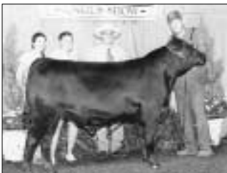
► Grand champion bull, Jett's Ebony Design J014 , by Jett's One Cow Ponderosa, Palmetto, Ga. He's a Sept. 2001 son of B/R New Design 036.