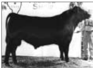
► Grand champion bull, Dameron PVF Liberty 104 , by Dameron Angus Farm, Lexington; Prairie View Farm, Gridley; and Weaver Angus Farm, Peoria. He's a Jan. 2001 son of Leachman Saugahatchee 3000C.