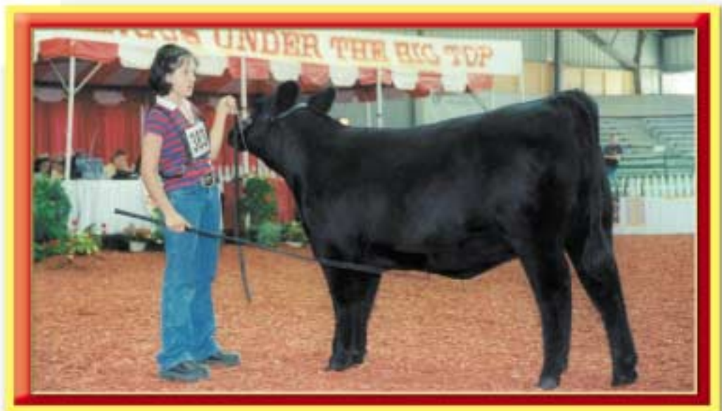
► The 2002 National Junior Angus Show, "Angus Under the Big Top," kicked off the cattle show Wednesday morning, July 10. Exhibitors showed steers, cow-calf pairs, bulls and heifers.