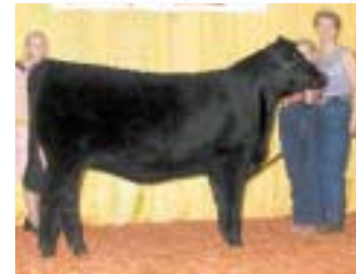
► Reserve intermediate champion, from class 7, DAJS Beulah L110 , by Katy Satree, Montague, Texas.