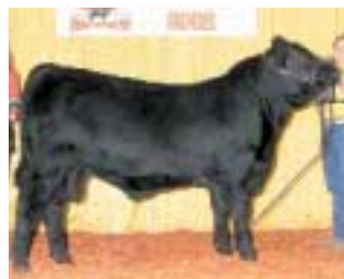
► Reserve intermediate champion, from class 5, Hillcrest Fullback 09H1 , by Megan Hill, Holly Pond, Ala.