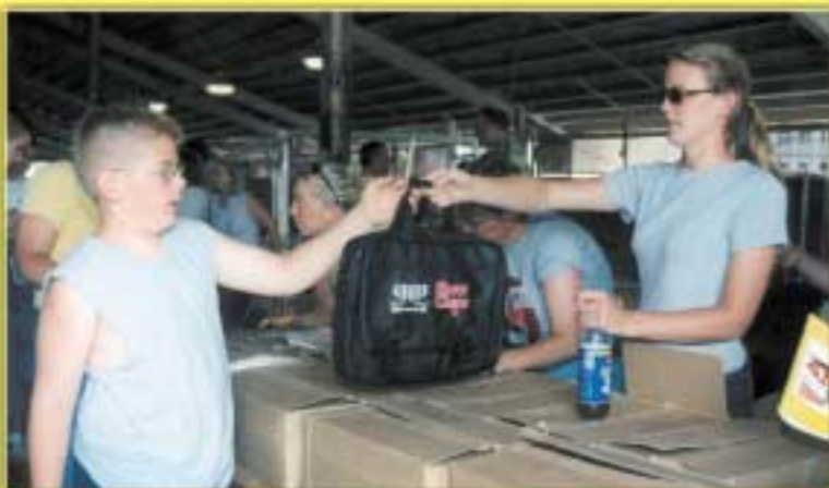
► A junior member receives his exhibitor's gift as he finishes the check-in process. Each NJAS exhibitor received a black tote filled with coupons, candy and Wisconsin tourist information.