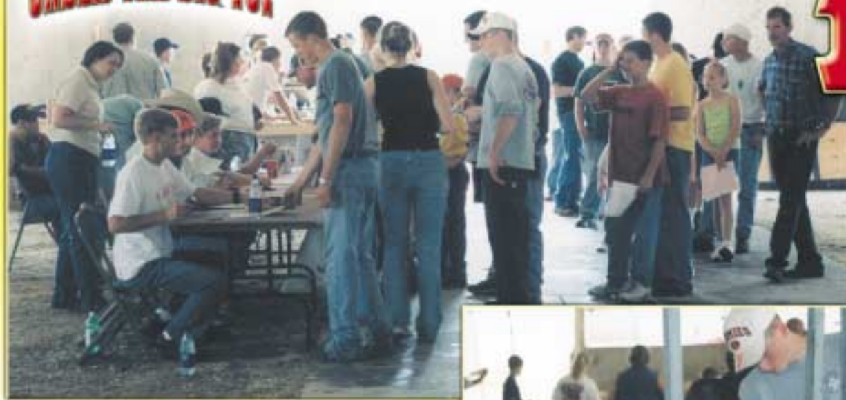
► Junior members line up with registration papers in hand to get checked in at the National Junior Angus Show (NJAS) in Milwaukee, Wis. Five hundred and fifty exhibitors went through the line during the two-day check-in process.