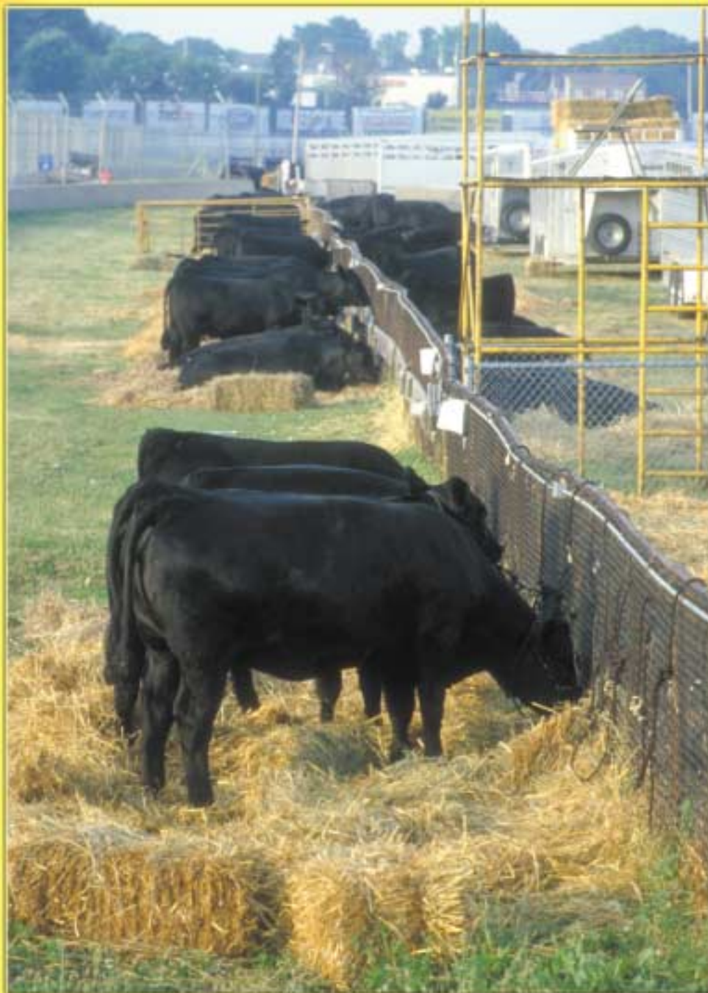
► Angus cattle circled the Milwaukee Mile racetrack at the 2002 National Junior Angus Show.

showcase the people who were the top individuals, states and exhibitors in the contests and cattle competitions. I ask that you look deeper than these pages as you examine the NJAS and discover that every young person at the event won by participating.