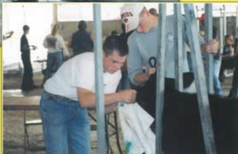
► Regional managers and National Junior Angus Association Board members check tattoo numbers before animals are allowed to exhibit in the 2002 NJAS. Junior Board members and regional managers had many responsibilities throughout the weeklong event.