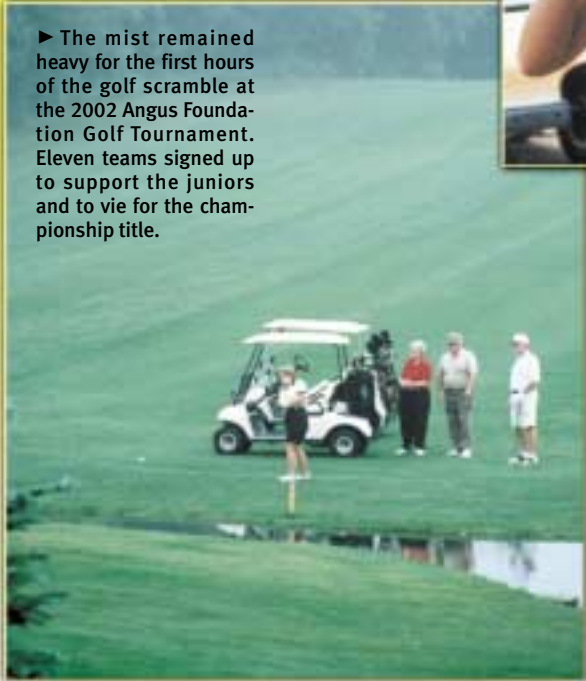
► The mist remained heavy for the first hours of the golf scramble at the 2002 Angus Foundation Golf Tournament. Eleven teams signed up to support the juniors and to vie for the championship title.