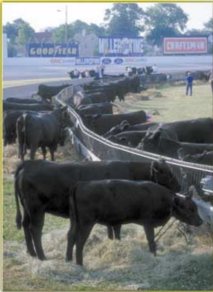
► Angus cattle stand tied on the curve of the Milwaukee Mile racetrack at the Wisconsin State Fair Park. Black cattle circled the racetrack while trucks and trailers were parked on the infield.