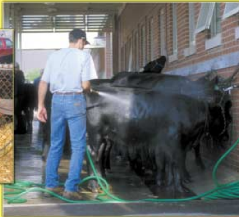
► The daily chore of rinsing cattle didn't end when the juniors made it to Milwaukee. The washracks were full, starting in the early morning, throughout the show.