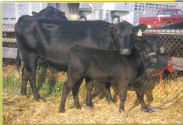
► A cow-calf pair rests in the tie-out area. Cattle were brought from the barns each night to rest on the soft straw and grass.