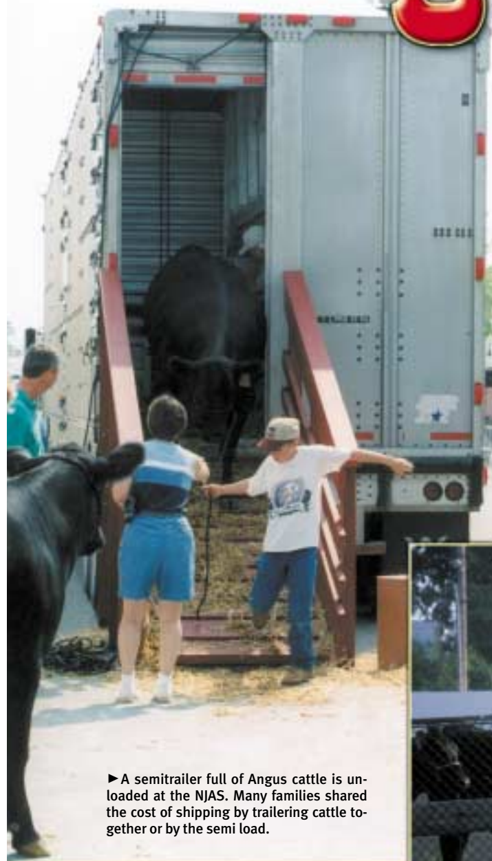
► A semitrailer full of Angus cattle is unloaded at the NJAS. Many families shared the cost of shipping by trailering cattle together or by the semi load.