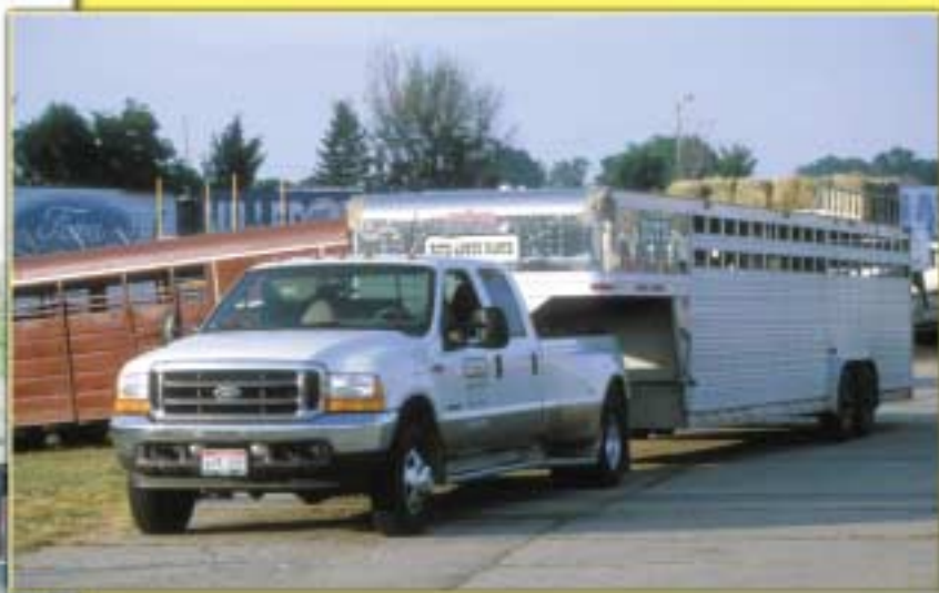
► Truck-and-trailer rigs flood the Wisconsin State Fair Park in Milwaukee, Wis., during the 2002 National Junior Angus Show. Cattle were trailered in from coast to coast for the weeklong event.