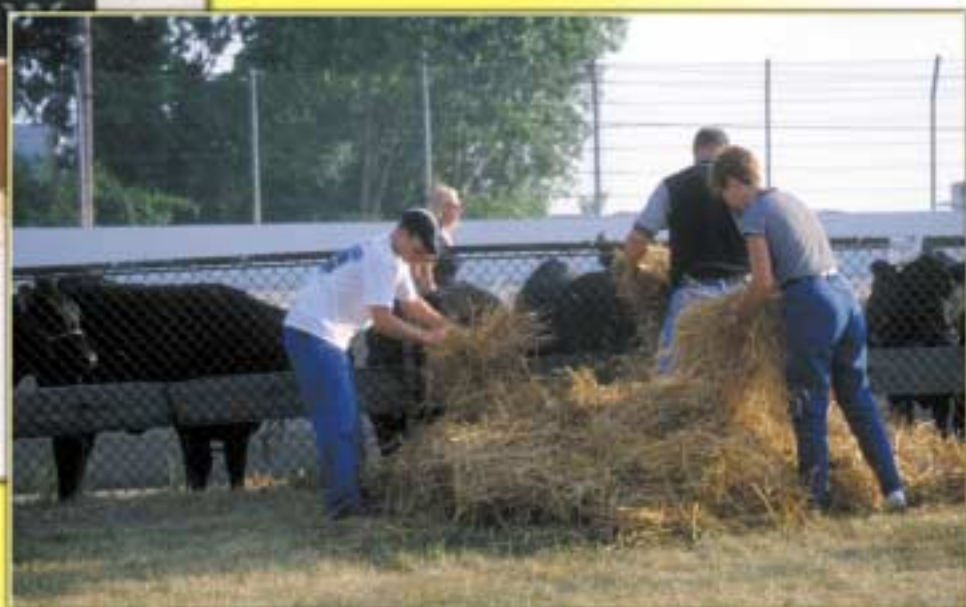
► Juniors and their parents spread straw so they could tie their animals out overnight. Tie-outs were especially crowded this year, with 950 animals entered in the show.