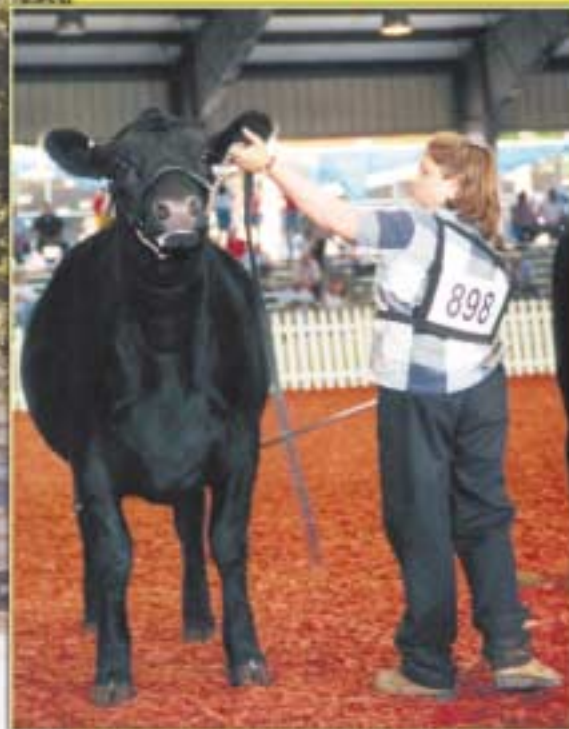
► The first day of the owned heifer show was Friday. A total of 558 heifers were shown.

► Above: Each morning, juniors had to bring their cattle in from tie-outs that circled the Milwaukee Mile racetrack to the barns. With temperatures in the mid-70s for most of the week, cattle, juniors and spectators enjoyed relief from the heat felt at past junior shows.