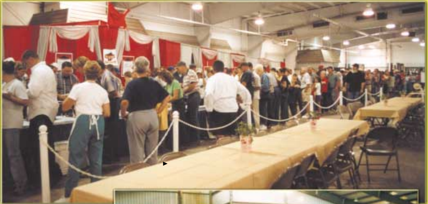
► Above: Friends of the National Junior Angus Show provided prime rib and rotisserie chicken, plus the extras, before the awards function. The meal was one of the most popular dinners served during the NJAS.