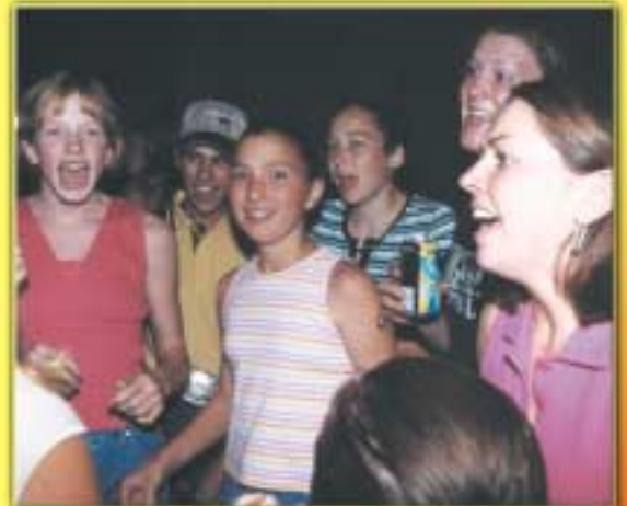
► The dance floor at the Sheraton Hotel was packed during the junior social that followed the awards ceremony. Parents enjoyed gambling and other casino games at the adult social.