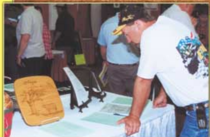
► Many people placed last-minute bids as the silent auction came to a close. The auction raised more than $5,000 to fund various junior programs.