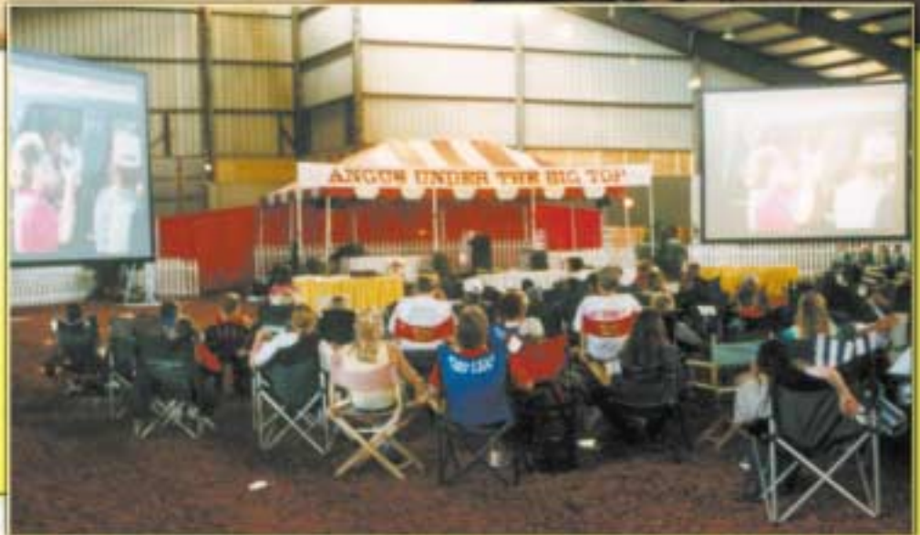
► Right: Two big screens are set up for viewing the awards and slide show. Junior members brought their stall chairs to the center of the ring to watch the show and accept their awards. Contest winners received black blankets.