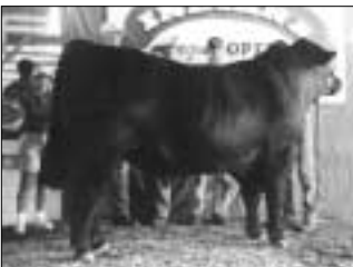
► Grand champion bull, TC Extra 9140 , by Wilson Cattle Co., Cloverdale; TC Ranch Inc., Franklin, Neb.; and Kiowa Creek Ranch, Elbert, Colo. He's a Feb. 1999 son of TC Stockman 365.