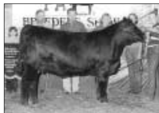
► Grand champion female, Krueger's Scaara 408J , by Amy Krueger, Coatesville. She's a Nov. 1999 daughter of Krueger's Back Stop 304G.