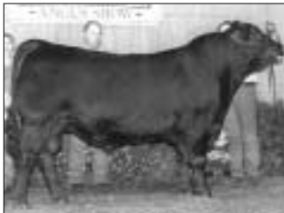
► Grand champion bull, Twin Hills 9174 , by Twin Hills Farm, Covington, Ga. He's a Nov. 1999 son of Famous 7001.