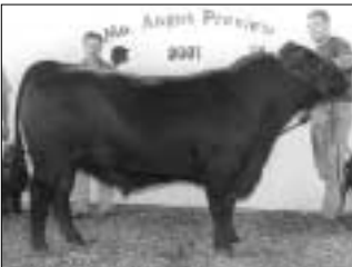
► Grand champion bull, Clearwater Rock 1439 , by Clearwater Farm, Springfield. He's a Sept. 1999 son of SVF GDAR 216 LTD.