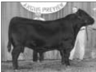
► Grand champion bull, Maple Valley Saughatchee 99 , by Maple Valley Ranch, Cumberland Furnace. He's a Jan. 1999 son of Leachman Saughatchee 3000C.