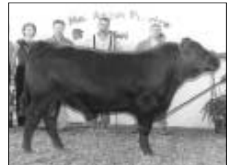
► Reserve grand champion bull, Circle A 216 LTD 0019 , by Circle A Ranch, Iberia. He's a Jan. 2000 son of SVF GDAR 216 LTD.