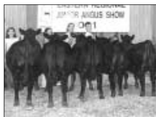
► First place state group of five, Georgia .