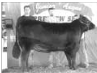
► Grand champion owned female, Twin Valley Blackcap 2819 , by Cassie Dorrell, Martinsville. She's a Sept. 1999 daughter of Whitestone Widespread MB.