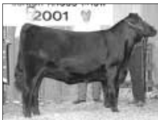
► Grand champion bred-and-owned female, Triple C Sasha Girl , by Chelsea Weiben, Leesburg, Va. She's an April 2000 daughter of Northern Improvement 4480 GF.