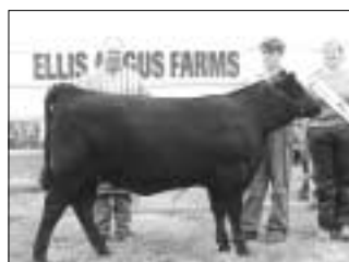
► Reserve grand champion owned female, PF Rita 580 of 5F16 136 , by Russell Behler, Notasulga. She's a Sept. 2000 daughter of Twin Valley Precision E161.