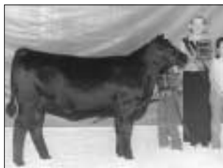
► Reserve grand champion owned female, PAF 914 Precision 51 , by Samuel Wallace, Mount Vernon. She's a Sept. 2000 daughter of GAR Precision 1680.