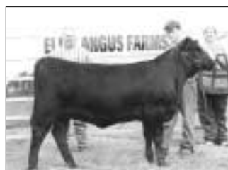
► Reserve grand champion bred-and-owned female, PF Jilt 560 , by Russell Behler, Notasulga. She's an Oct. 2000 daughter of N-Bar Emulation EXT.