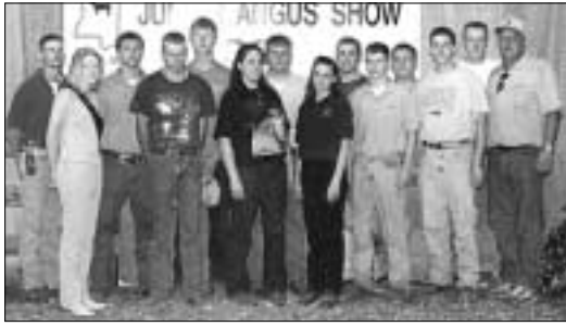
► Virginia juniors won the state herdsmanship award.