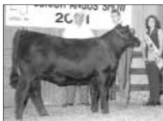
► Reserve grand champion bred-and-owned female, Grandview Womack Rita 1370 , by Wesley Womack, Pembroke, Ky. She's a June 2000 daughter of Northern Improvement 4480 GF.