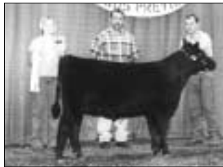
► Grand champion bred-and-owned and reserve grand champion owned female, DEF Full Onyx , by Dallas Felton, Decherd. She's a Nov. 2000 daughter of Rito 9FB3 of 5H11 Full-back.