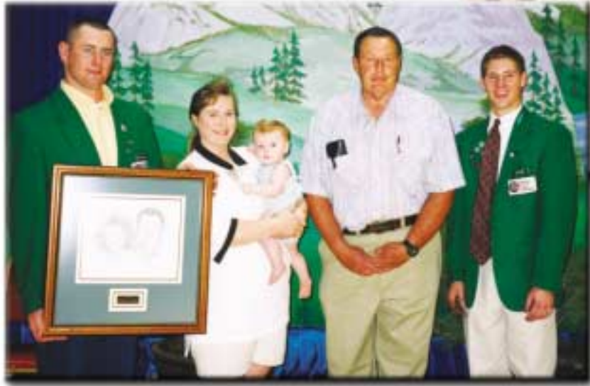
► Left: The Advisor of the Year and Honorary Angus Foundation awards are presented Friday morning during the owned heifer show. Other awards are announced Friday evening at the National Junior Angus Association (NJAA) awards function. For more coverage, see page 202. lz