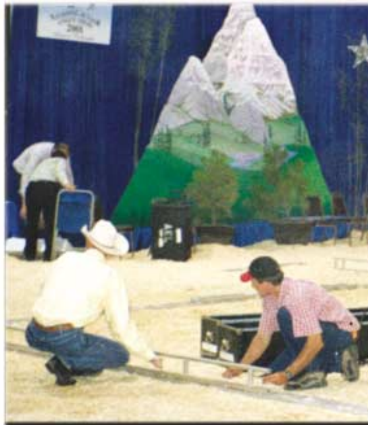
► A popular part of the NJAA awards function is the annual slide show, which incorporates photographs of participants and their families during the week. The slide show is presented on a huge screen in the middle of the showing. lz