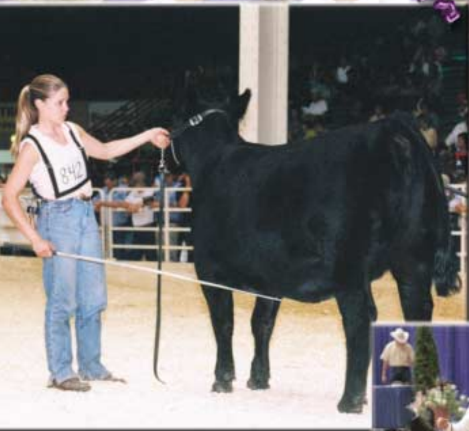
► Junior members with owned heifers take to the showing early Friday morning. A total of 595 owned heifers were shown. cb