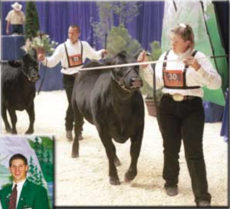
► Above: Showmanship competitors begin the first round of competition Friday afternoon. At its conclusion, 15 are selected to be in the final round to vie for top showman. lz