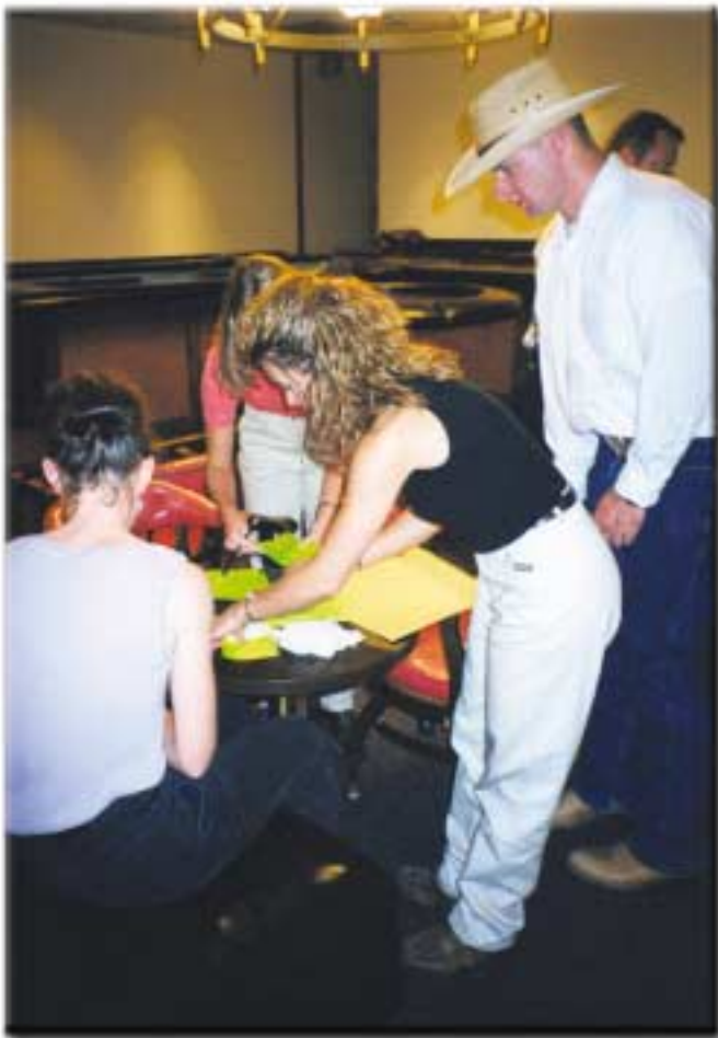
► For 11 juniors, the moment of truth comes with the collection of ballots at the NJAA election. Only six members would be chosen. New Board members are announced Friday evening at the NJAA awards function. lz