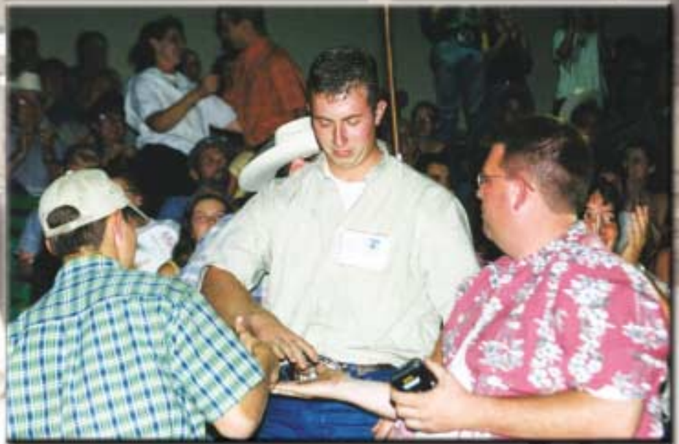
► For NJAA Board candidates, who hail from 11 different states, meeting and talking with other NJAA members at the National Junior Angus Show (NJAS) is their main form of campaigning. They are not allowed to use buttons, cards, stickers, fliers, pens or any other promotional items. cb