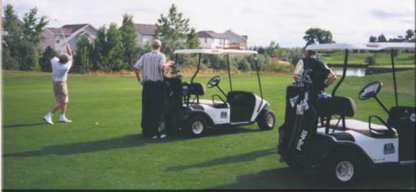
► Early Tuesday morning, 14 teams of Angus enthusiasts converge on Thorncreek Golf Course for the first-ever Angus Foundation golf tournament. For complete coverage of the tournament, see page 230. lz