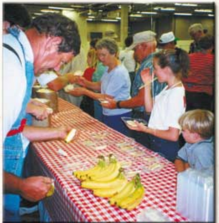
► Following opening ceremonies, the evening culminates with banana splits provided by the Nebraska Angus and Nebraska Junior Angus associations. lz