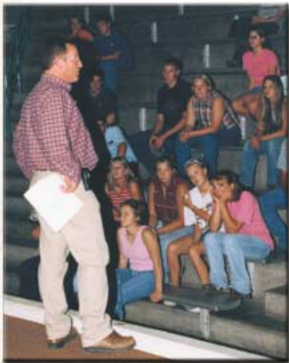
► Sixty-five juniors attend a briefing before they begin their duties as delegates to the National Junior Angus Association (NJAA) Annual Meeting. As state representatives, they use opportunities throughout the week to meet with candidates vying for positions on the NJAA Board of Directors. cb