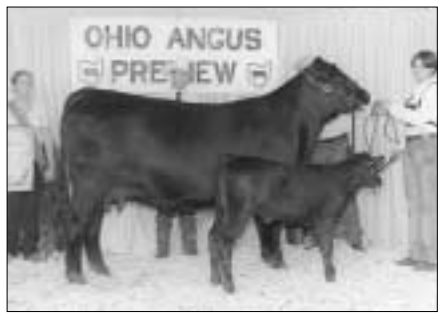
Grand champion cow-calf pair, Champion Hill Georgina 1019, by Champion Hill, Bidwell, and Dynasty Farms, Gallipolis. She's a Jan. 1998 daughter of Whitestone Widespread MB. Her calf is an April 2000 son of Champion Hill Brave.