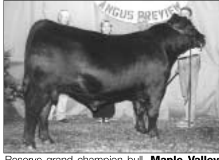
Reserve grand champion bull, Maple Valley Saugahatchee 99, by Maple Valley Ranch, Cumberland Furnace. He's a Jan. 1999 son of Leachman Saugahatchee 3000C.