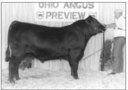
Grand champion bull, Champion Hill Apache, by Champion Hill, Bidwell. He's a Feb. 1999 son of N-Bar Emulation EXT.