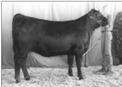
Reserve grand champion bred-and-owned female, RCL Black Pearl 925 , by Sydney Geppert, Mitchell. She's a March 1999 daughter of N-Bar Emulation EXT.