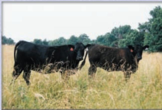
Retaining the winter hair coat into the summer is a good indicator that cattle are being affected by alkaloid toxicosis in infected tall-fescue pastures. Within any herd, some individuals may exhibit signs of the toxicosis while others do not.