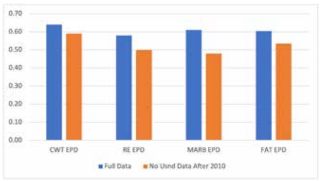
Figure 3: Average carcass EPD accuracies on Young Sires (n=4,479) with and without the full set of carcass ultrasound records submitted after 2010.

Figure 2: Average carcass EPD accuracies on Proven sires (n=174) with and without the full set of carcass ultrasound records submitted after 2010.