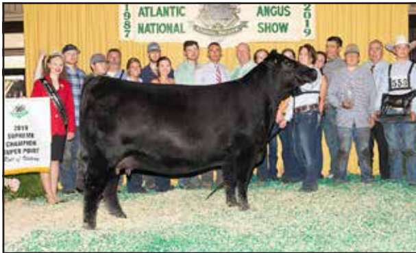
Grand champion female and supreme champion SCC SCH Phyllis 714