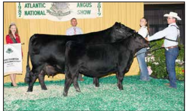
Grand champion embryo transplant cow-calf pair AED Rita 328A