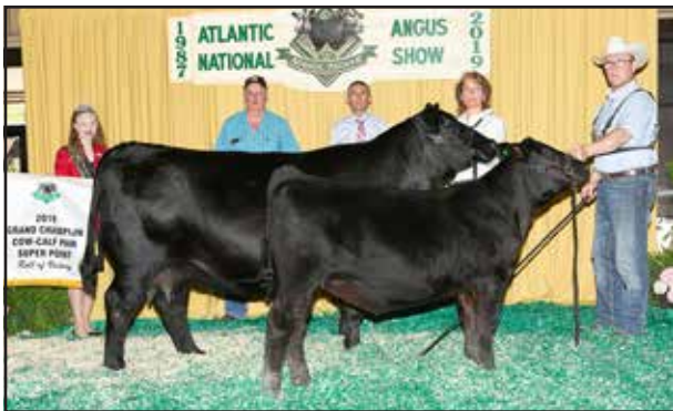
Grand champion natural cow-calf pair Cherry Knoll Ark Pride 1593