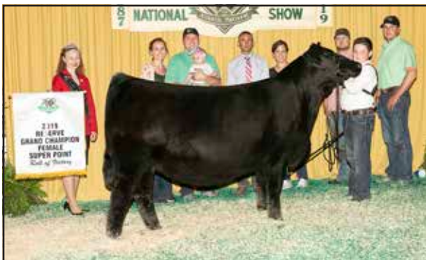
Reserve grand champion female FCF Phyllis 770