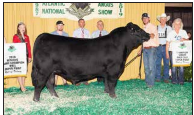
Reserve grand champion bull MK Silver Star E94