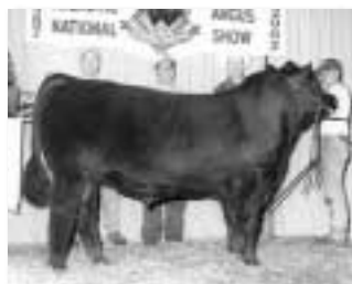
► Reserve senior calf champion, EXAR Improvement 0913 , by El Cuyum Andino, Mendoza, Argentina, and Express Angus Ranches, Shawnee, Okla. He's a Nov. 2000 son of Northern Improvement 4480 GF.