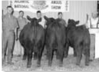
► First-place junior get-of-sire, progeny of Leachman Saugahatchee 3000C , by Champion Hill, Bidwell, Ohio.