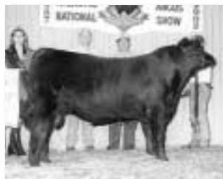
► Early spring calf champion, EXAR Expression 1213 , by Express Angus Ranches, Shawnee, Okla. He's a Jan. 2001 son of EXAR on the Money 7654.