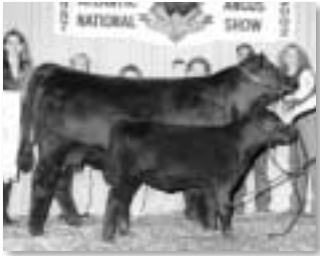
► Intermediate champion, Weaverland HF Sunflower 033 , by Weaverland Valley Farms, New Holland, Pa., and Hawthorn Farm, McVeytown, Pa. She's a June 2000 daughter of Leachman Explorer.