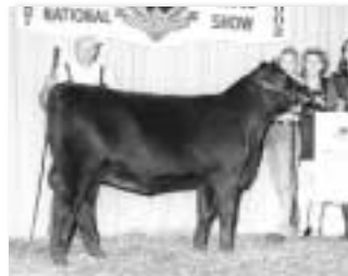
► Late summer calf champion, Champion Hill Heidi 2587 , by Fox Cross Farm, Alderson, W.Va., and Champion Hill, Bidwell, Ohio. She's a July 2001 daughter of SAV Limited Edition 9283.