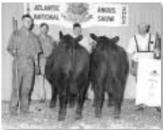
► First-place produce-of-dam, progeny of Champion Hill Lady 391 , by Champion Hill, Bidwell, Ohio, and Fox Cross Farm, Alderson, W.Va.