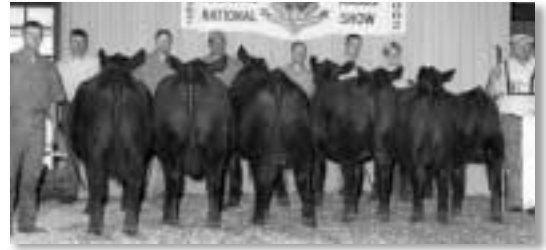
► First-place breeder's best six head, by Champion Hill , Bidwell, Ohio.