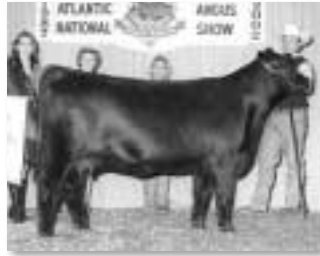
► Reserve intermediate champion, Champion Hill Peg 2141 , by Fox Cross Farm, Alderson, W.Va., and Champion Hill, Bidwell, Ohio. She's a July 2000 daughter of Leachman Saugahatchee 3000C.