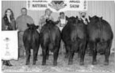
► First-place get-of-sire, progeny of North-ern Improvement 4480 GF , by Laffin Ranch, Olsburg, Kan.