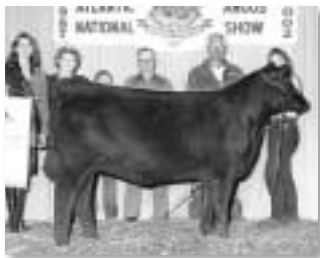
► Reserve late spring calf champion, RSFF Natilee 1021 , by Brittany Full, Mount Airy, Md. She's an April 2001 daughter of Champion Hill B52 Traveler.