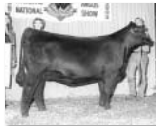
► Reserve senior calf champion, Champion Lady 2182 , by Kahn Cattle Co. LLC, Rydal, Ga., and Champion Hill, Bidwell, Ohio. She's a Sept. 2000 daughter of Leachman Saughatchee 3000C.