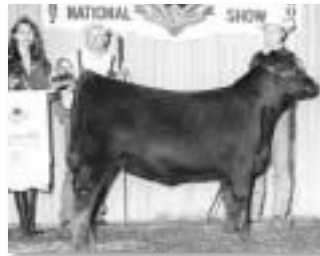
► Early fall calf champion, Champion Hill Lady 2647 , by Fox Cross Farm, Alderson, W.Va., and Champion Hill, Bidwell, Ohio. She's a Sept. 2001 daughter of Leachman Saugahatchee 3000C.