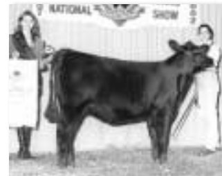
► Reserve late summer calf champion, Gamble's Skymere 807 , by Holly Gamble, Clinton, Tenn. She's an Aug. 2001 daughter of Gamble's Saugahatchee 302.