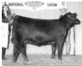
► Early spring calf champion, Champion Hill Georgina 2335 , by Fox Cross Farm, Alderson, W.Va., and Champion Hill, Bidwell, Ohio. She's a Jan. 2001 daughter of Leachman Saughatchee 3000C.