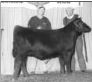
► Late fall calf champion, Champion Hill Georgina 2261 , by Champion Hill, Bidwell, Ohio; and Kahn Cattle Co. LLC, White, Ga. She's a Nov. 2000 daughter of Connealy Kincaid.