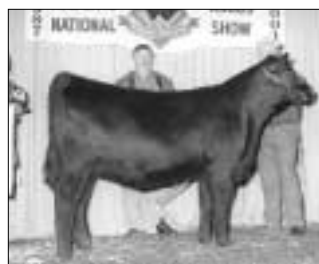
► Reserve late summer calf champion, Champion Hill Georgina 2121 , by Champion Hill, Bidwell, Ohio; and Dobson Pulpwood Farm, Campti, La. She's a July 2000 daughter of SAF 598 Bando 5175.