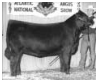
► Reserve early spring calf champion, OHL Foxy Barbara 017-1 , by Fox Cross Farm, Alderson, W.Va. She's a Jan. 2000 daughter of Woodhill Supreme.