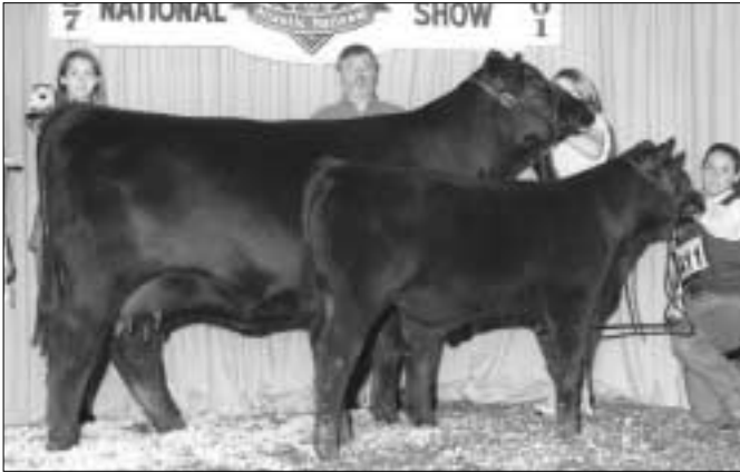
► Reserve grand champion cow with natural calf and reserve junior champion female, Champion Hill Shadoe 1422 , by Champion Hill, Bidwell, Ohio; and Dobson Pulpwood Farm, Campti, La. She's a Jan. 1999 daughter of Leachman Saughatchee 3000C. Her calf is a Jan. 2001 son of Generation Band 505.