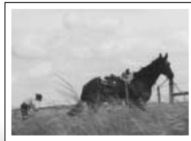
For Mike Sitz, maintaining fences and checking pastures on the 5,000-acre ranch is most efficiently done on horseback.