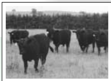
Thoene Angus offers rugged, range-ready bulls to commercial producers across the Sandhills region.

Thoene Angus Ranch is a member of the American Angus, Nebraska Angus and Sandhills Cattle associations, and the Nebraska Cattlemen.