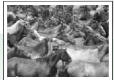
Haythorn Land & Cattle Co. has been recognized by the American Quarter Horse Association for its outstanding remuda.