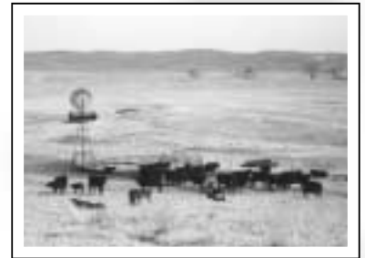
The Krayes' extensive use of AI allows them to access the breed's top sires and to create a diversity of genetics in their registered Angus herd.