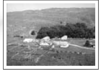
Kraye Angus operates on nearly 20,000 acres of rolling Sandhills near Mullen.