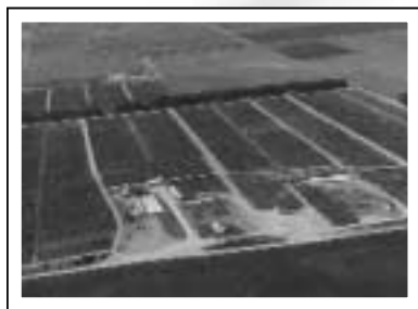
A group of local cattlemen owns Darr Feedlot, which has a one-time capacity of 29,000 head.

Located just above the Ogallala Aquifer, ample grain and forage supplies are always available. Darr Feedlot is in Dawson County, which ranks second in cattle, fifth in corn and first in alfalfa production in the state of Nebraska.