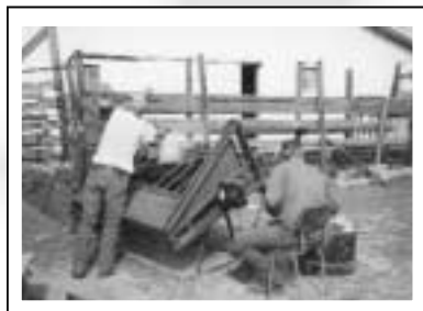
The crew at Thoene Angus work spring-born calves.

The ranch was founded in 1962 and has included registered Angus since 1976. Artificial insemination (AI) has been used since the beginning, breeding to sires both inside and outside of the herd, allowing for improvement of the performance, maternal and carcass quality of the cow herd. Providing seedstock that enable their customers to be more profitable has always been a primary goal for this family-owned Angus operation.