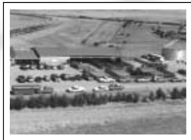
Here's an aerial view of the Summitcrest facility during their spring bull sale.

Summitcrest has been honored as the 1998 NCBA Region I Beef Business of the Century and the 1991 Beef Improvement Federation (BIF) Seedstock Producer of the Year. The ranch received the CAB Commitment to Excellence Award in 1992.