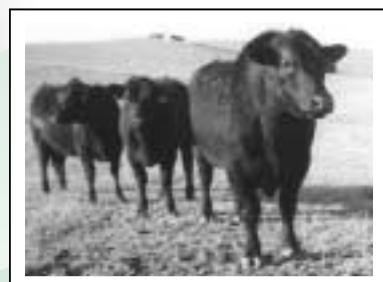
Bulls used in the Wm. Zutavern herd are selected for a balance of performance, composition and carcass traits.