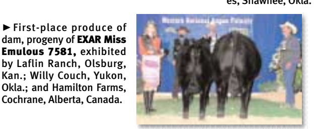
► Northern Improvement 4480 GF sired the winning junior get-of-sire entry, exhibited by Express Angus Ranches. Shawnee. Okla.