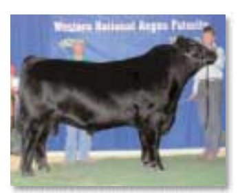
► Reserve intermediate champion, Moffitt Stocker 0030 of PF, by Pollard Farms LLC, Enid, Okla.; and Moffitt Angus Farms, Colfax, Iowa. He's a May 2000 son of TC Stockman.