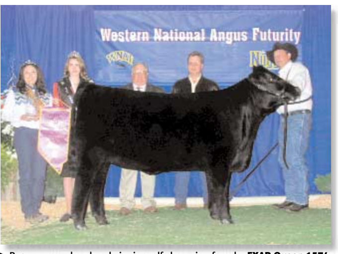
► Reserve grand and early junior calf champion female, EXAR Queen 1574 , by Monarch Farm, Folsom, La. She's a Jan. 2001 daughter of A&B Yukon 7150.