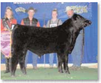
► Reserve late junior calf champion, GC Bingo's Little Bear, by Trista Good, Wheatland, Wyo. He's a Sept. 2001 son of Traveler 3077 BCAR.