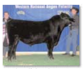
► Senior calf champion, EXAR Improvement 0913, by Express Angus Ranches, Shawnee, Okla.; and El Cuyum Andino, Mendoza, Argentina. He's a Nov. 2000 son of Northern Improvement 4480 GF.