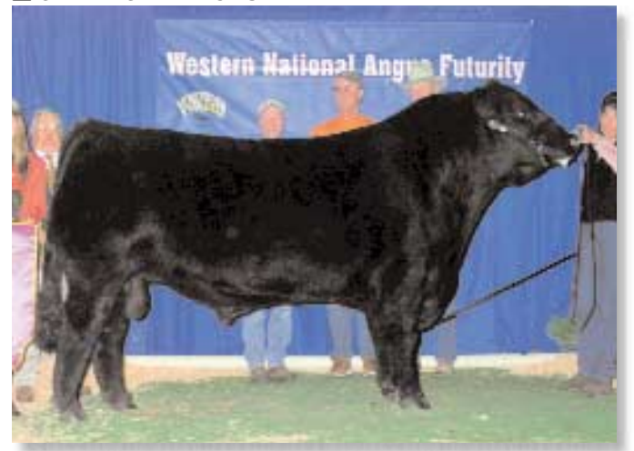
► Grand and senior champion bull, TJ Amigo V615 , by TJ Cattle Co., Columbus, Mont.; and Suburban Home Farm, Spencer, Ind. He's a Feb. 1999 son of TC Stockman 365.