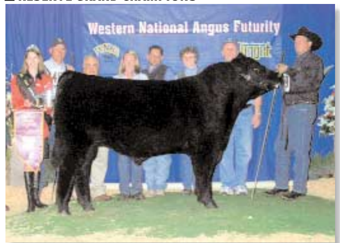
► Reserve grand and early junior calf champion bull, EXAR Sudden Impact 1537 , by Express Angus Ranches, Shawnee, Okla.; Rolling RRR Ranch LLC, Edmond, Okla.; and Monarch Farm, Folsom, La. He's a Jan. 2001 son of Northern Improvement 4480 GF.