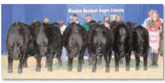
► First-place best-six-head entry, exhibited by Express Angus Ranches, Shawnee, Okla.