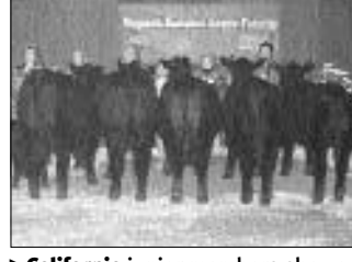
► California junior members showed the best five head from one state.