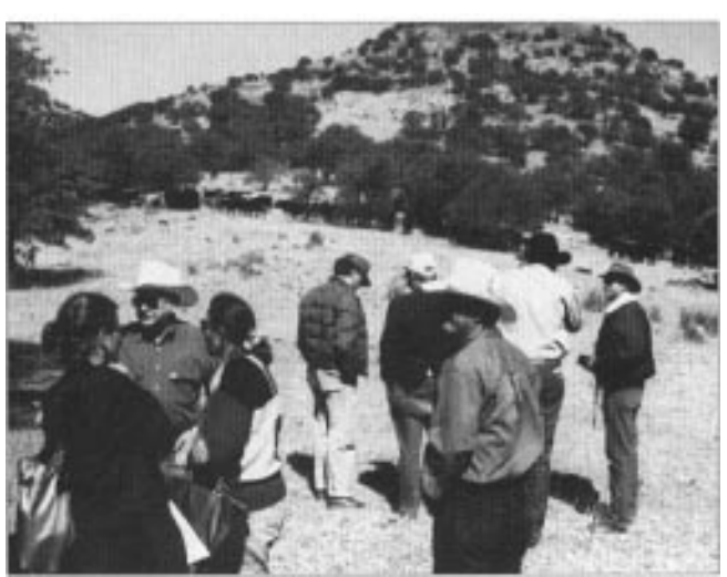
Tour participants view Angus cattle and visit at the Walace-Jeffers Ranch near Casas Grandes.

performance information on their cattle. Canadian Angus, for the most part, don't have in-herd or EPD comparisons for breeders to use in sire selection or mating decisions.