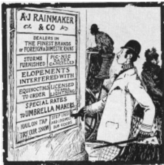
From Harper's Weekly, October 24, 1891.