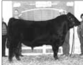
► Reserve grand champion bull, A&B 216 Limited 0239 , by A&B Cattle, Bassett. He's an April 2000 son of SVF GDAR 216 LTD.