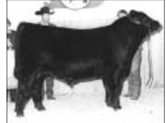
► Reserve grand champion bull, DTA New Design 106 899 036 , by Currens Bros. LLC, Harrodsburg. He's a March 2001 son of B/R New Design 036.