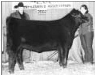
► Grand champion female, Weisel Jestress 1130 , by Tyler Weisel, Louisville. She's a March 2001 daughter of Whitestone Widespread MB.