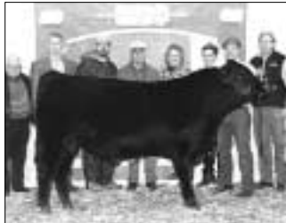
► Grand champion bull, HAF Entensifier 41 , by Hollman Angus, Martell. He's a Jan. 2001 son of Sitz Entensifier 8206.