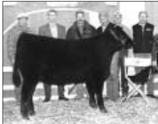
► Grand champion female, KJ H109 Dolly P38 , by KJ River Ranch, Holdrege. She's a Jan. 2001 daughter of TS Mercedes 9834.