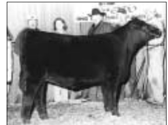
► Reserve grand champion female, OH48 by Famous 7001 , by Bob Hayes, Cumberland. She's a Sept. 2000 daughter of Famous 7001.