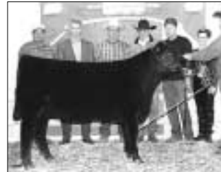
► Reserve grand champion female, Pride's/Fred's Wix Cap 110 , by Black Pride Genetics, Herman. She's a Jan. 2001 daughter of Northern Improvement 4480 GF.