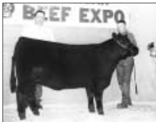
► Grand champion female, MSU Elba 0123 , by Michigan State University, East Lansing. She's a Feb. 2001 daughter of Rito 4V3 of Rita 2SE3 692.