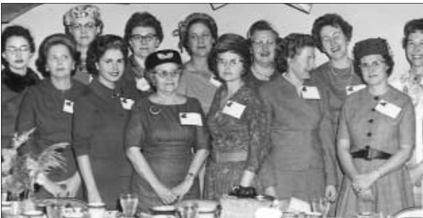
State presidents in attendance at a 1961 American Angus Auxiliary luncheon.