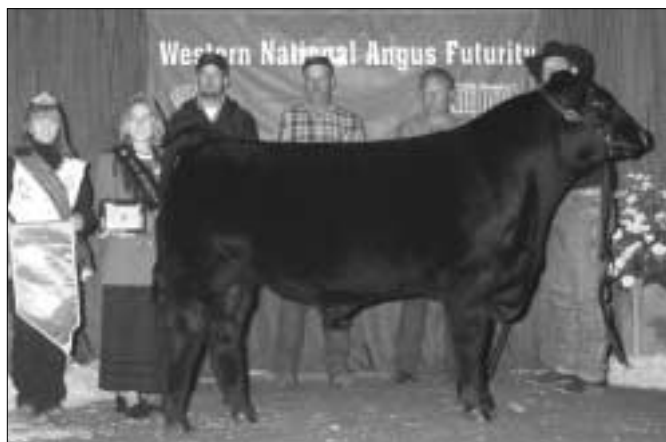
Reserve early junior calf champion, Black Gold 0424 , by Rolling RRR Ranch LLC, Edmond, Okla.; and Express Angus Ranch, Shawnee, Okla. He's a Feb. 2000 son of Northern Improvement 4480 GF.