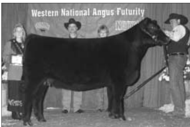
Reserve intermediate champion, Broken Arrow Forever Lady 921 , by Broken Arrow Ranch, Lincoln, Calif.; and Roth Angus Ranch, Freeman, S.D. She's a July 1999 daughter of GDAR SVF Russ 184B.