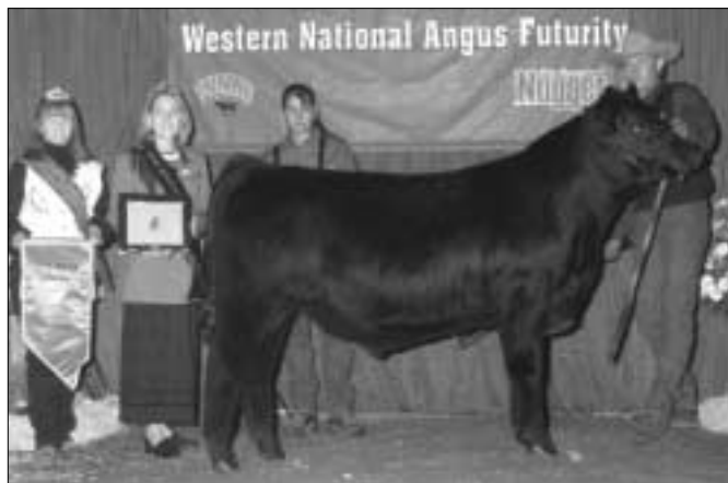
Late junior calf champion, BAAR Wintun E46 , by Broken Arrow Angus Ranch, Lincoln, Calif. He's an Aug. 2000 son of GDAR SVF Russ 184B.