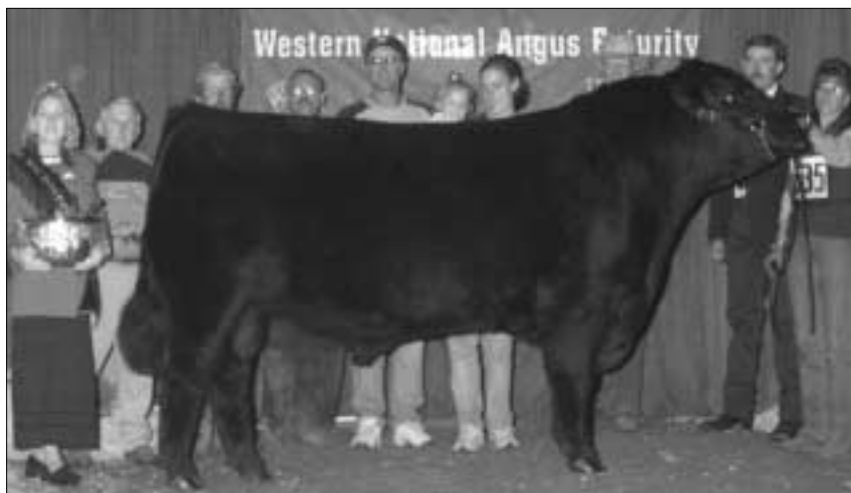
Grand champion and junior champion bull, TJ Amigo V615 , by TJ Cattle Co., Columbus, Mont.; and Suburban Home Farm, Spencer, Ind. He's a Feb. 1999 son of TC Stockman 365.

Photos of overall and division winners follow. To review class placings, visit the Angus Journal coverage of the show on the Internet at www.angusjournal.com/reno/ .