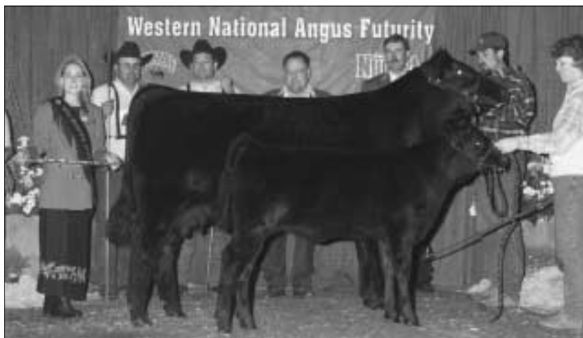
Grand champion cow-calf, and reserve grand champion and junior champion female, WK Arkdale Pride 9353 , by Monarch Farm, Folsom, La.; Whitestone-Krebs, Gordon, Neb.; and Express Angus Ranch, Shawnee, Okla. She's a Feb. 1999 daughter of WK Latitude. Her calf is a Feb. 2001 daughter of Bon-View New Design 1407.