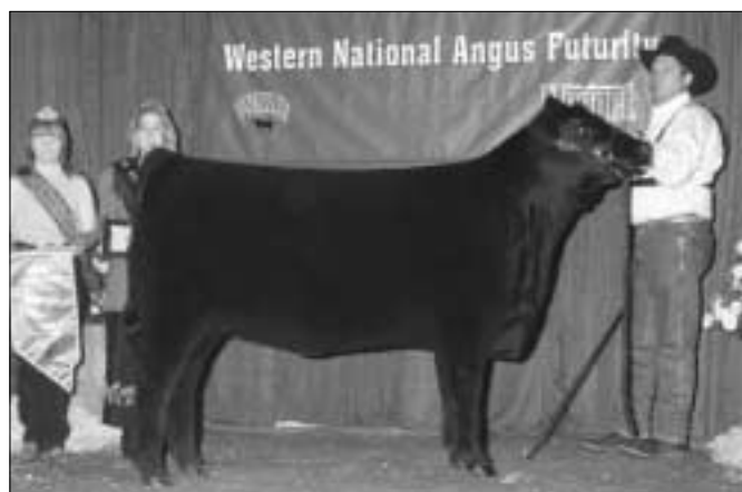
Reserve early junior calf champion, EXAR R3 Miss Forever 0423 , by Rolling RRR Ranch LLC, Edmond, Okla.; and Express Angus Ranch, Shawnee, Okla. She's a Feb. 2000 daughter of Northern Improvement 4480 GF.