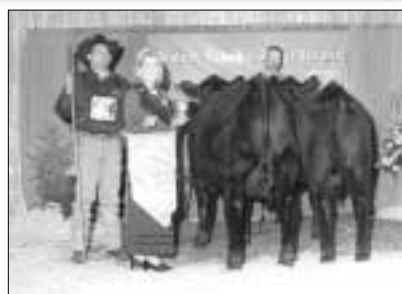
Progeny of GDAR Miss Forever 015 won the produce-of-dam award. Express Angus Ranch, Shawnee, Okla.; and Roth Angus, Freeman, S.D., own the winning pair.