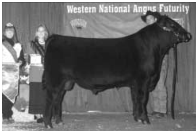
Reserve late junior calf champion, EXAR Alota 0475 , by Express Angus Ranch, Shawnee, Okla. He's an April 2000 son of A&B Yukon 7150.