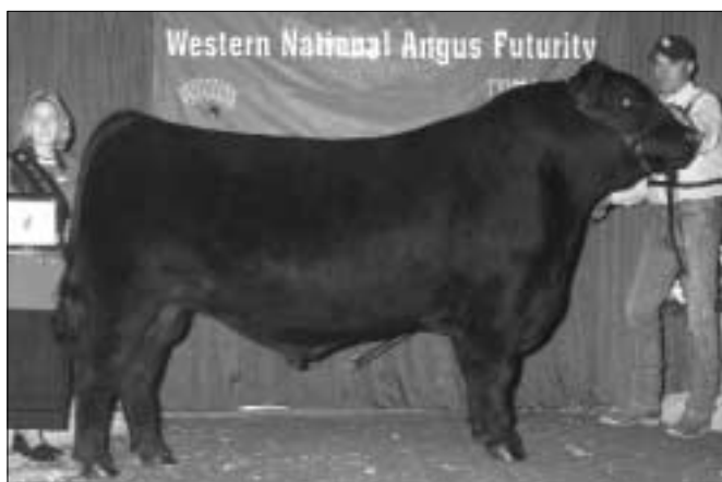
Intermediate champion, EXAR Stampede 9489 , by S&M Farms, Canton, S.D.; and Express Angus Ranch, Shawnee, Okla. He's a July 1999 son of A&B Yukon 7150.