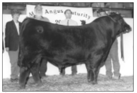
Grand champion bull, Circle A Backstop 8535 , by Circle A Ranch, Iberia. He's a Sept. 1998 son of OCC Backstop 888B.