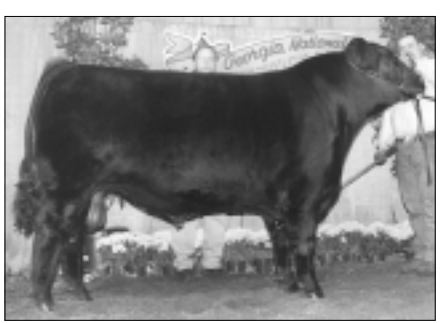
Reserve grand champion bull, Bush's Roll On, by HAE Angus, Alma, III. He's a March 1998 son of GDAR Rolls Royce 203.