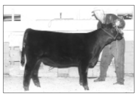
Reserve grand champion female, MCA Ida 99 , by Macauley's Curview Angus, Oregon, Ill. She's a July 1999 daughter of MCA Cornerback 96.