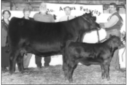
Grand champion female, Circle A Empress 8137, by Circle A Ranch, Iberia. She's a Jan. 1998 daughter of Krugerrand of Donamere 490.