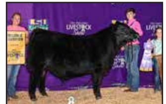
Reserve grand champion bull PVF JJBF Marvel 2002