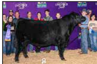
Grand champion bull Comite Hills Cash Money 2106