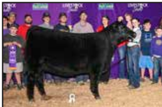
Grand champion female Checkerhill Viola 171