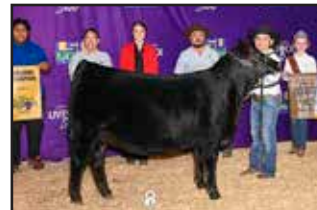
Reserve grand champion female R&R Blackbird 6058 2017